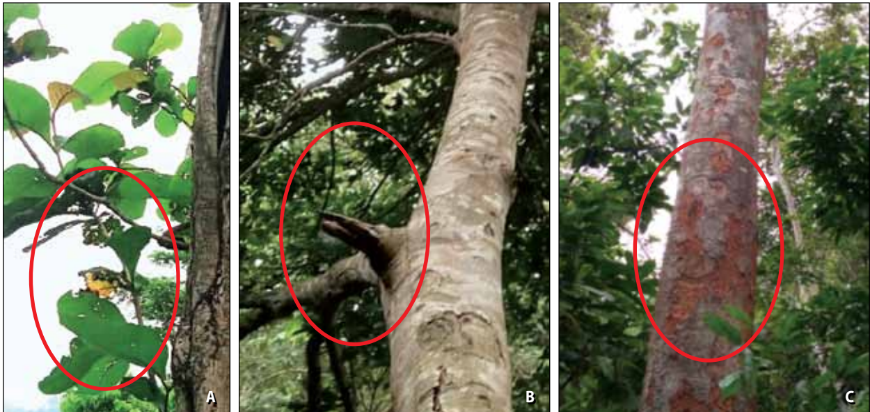
Figure 3. Types of damage: A – damaged foliage on teak trees ( Tectona grandis ); B – broken branch on jengkol trees ( Achidendron pauciflorum ); C – open wounds on petai trees ( Parkia speciosa )

leaves, which are no longer green, turn yellow, fall off and also have holes due to pests (Safe'i et al. 2021).