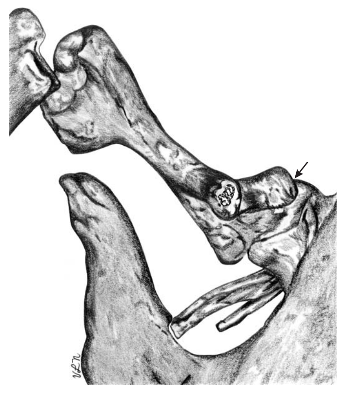
Fig. 3. Enface view of right proximal humeral articular surface of Odontochelys semitestacea Li, Wu, Rieppel, Wang, and Zhao, 2008 from the Lower Carnian (Upper Triassic) Wayao Member of the Falang Formation; Guanling, Guizhou Province, southwest China (IVPP V 13240). Irregular defect (arrow) is characteristic for the avascular necrosis found with decompression syndrome.

Infectious or septic arthritis is well recognized in turtles, having been noted in Dermochelys coriacea (Ogden et al. 1981; Coquelet 1983; Brogard 1987), Lepidochelys kempii (Harms et al. 2002; Greer et al. 2003; Jacobson 2007), Geochelone agassizii (Frye 1984; Homer et al. 1998), Geochelone elegans (McArthur 2004) and Acanthochelys macrocephala (Rhodin et al. 1990), but always limited in distribution to elbow, knee, and manus or pes. Jacobson (2007) suggested that these infections represent complications of injury. His perspective is supported by absence of infectious arthritis