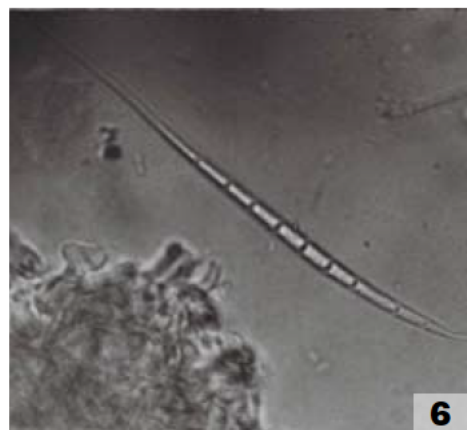
Figs 1-6. Therrya fuckelii . 1. Circular, 30-50 m wide area with Scots pines colonized by T. fuckelii ; all needles fell three months after death of trees. 2, 3. Apothecia; more numerous on stems with intact bark (2) and less numerous on stems with brittle and discolored bark (3). 4. Final stage of apothecial development. 5. Fragment of hymenium. 6. Ascospore. Scale bars for Fig. 4 = 5 mm, for Fig. 5 = 20 \mu\text{m} , for Fig. 6 = 10 \mu\text{m} .