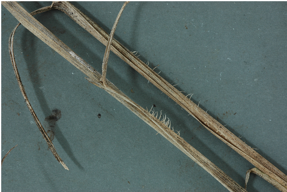
Fig. 3 Basidiomata of Pterula gracilis (Desm. & Berk.) Corner from Kampinos National Park (2018-09-09).