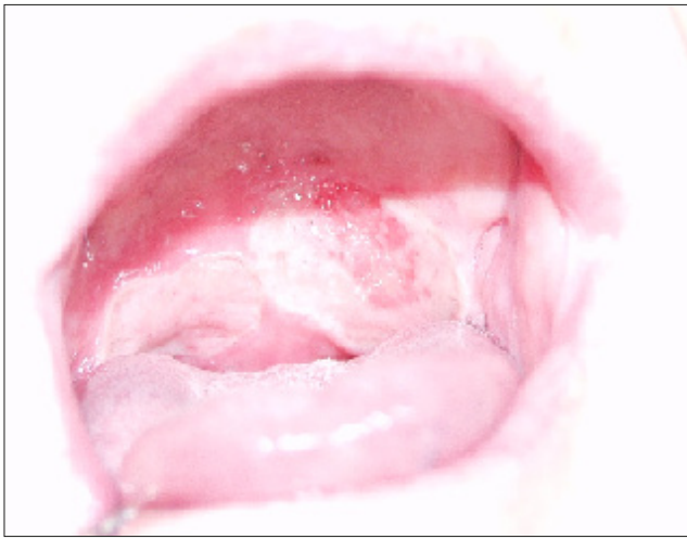
Figure 1. Ulceration on the soft and hard palate