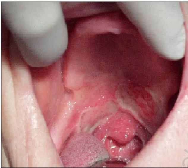
Figure 2. Lymphoma affecting the soft palate, edge of the hard palate and right palatoglossal arch