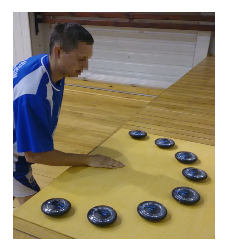
Figure 1. Station for the measurement of visuomotor task

Light discs were placed on a plate with dimensions of 110 × 80 cm at intervals of 20 cm apart and 45 cm from the designated starting point, according to the scheme shown in Figure 1. The task was to perform the fastest hand movement in order to touch the disc surface and deactivate the lights.