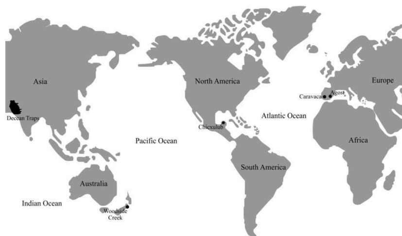
Figure 1. Geographic locations of the KPB clays at Caravaca, Agost and Woodside Creek enriched with Ir and As, including the Chicxulub impact site and Deccan Traps.

Ejecta layer. Alvarez et al. [1] explained the presence of anomalous iridium (Ir) in prominent marine Cretaceous-Paleogene (KPB) clays at three localities (Gubbio in Italy, Stevns Klint in Denmark, and Woodside Creek in N. Zealand) by proposing a late Cretaceous asteroid impact. Around the same time Smit and Hertogen [2] reported an anomalous Ir in the marine boundary clay at Caravaca (Spain). This suggestion was followed by reports of the Ir anomaly in many other marine/continental boundary clays worldwide [3]. These clays mark one of the most significant impact events in the Phanerozoic, one that appears responsible for one of the greatest extinctions in Earth's history.