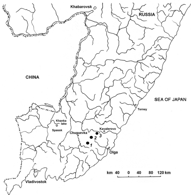
Fig. 1. Location of studied populations (1 – Ussuriysky; 2 – Medvezhy; 3 – Verkhneussuriysky).