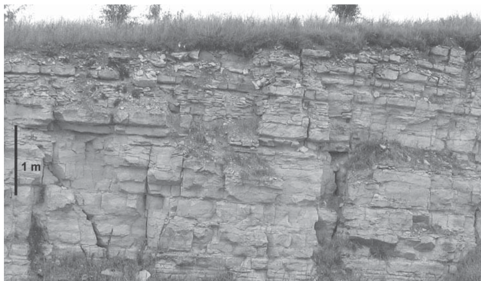
FIGURE 1. Quarry at Strzeżów (Miechów)