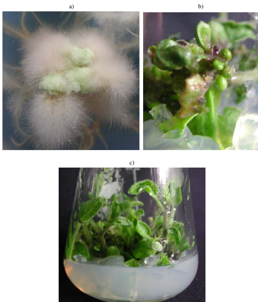
Phot. 2. Callus with regenerated roots of Lycopersicon peruvianum (a), shoots (b) and plants (c). Fot. 2. Zregenerowane z tkanki kalusowej Lycopersicon peruvianum : korzenie (a), pędy (b) i rośliny (c).

and cytokinin BAP, in both proportions examined. In the case of cultures maintained in darkness, a callus of the highest weight was obtained on a medium containing 2.0 \text{ mg}\cdot\text{dm}^{-3} of auxin NAA (1.45 g) and NAA together with cytokinin in a 2:1 ratio (1.11 g). When the culture was maintained in light or in darkness, auxin NAA and cytokinin BAP in a 1:1 ratio had a stimulating effect on the forming of the 'Maskotka' callus (tab. 3).