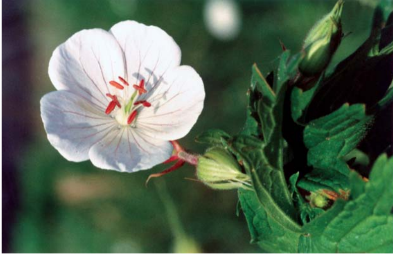
Phot. 3. Geranium pratense , Lubiń, com. Krzywiń – roadside

Fot. 3. Geranium pratense , Lubiń, gm. Krzywiń – przydroże