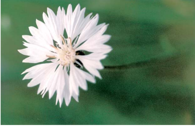
Phot. 2. Centaurea cyanus , Chrząstowo, com. Książ Wilkp. – in rye culture

Fot. 2. Centaurea cyanus , Chrząstowo, gm. Książ Wilkp. – w uprawie żyta