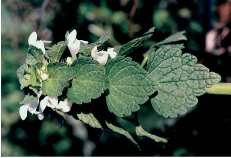
Phot. 4. Lamium purpureum , Mchy, com. Książ Wlkp. – roadside ditch

Fot. 3. Geranium pratense , Lubiń, gm. Krzywiń – przydroże