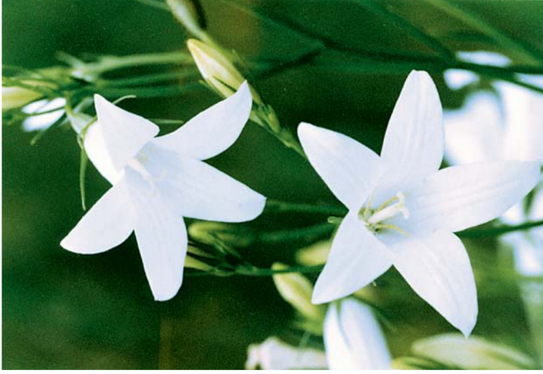
Phot. 1. Campanula patula , Lipówka, com. Dolsk – dry waste land

Fot. 1. Campanula patula , Lipówka, gm. Dolsk – suchy nieużytek