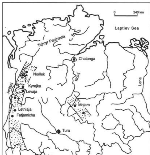
Fig. 1. Map of the Siberian Platform showing distribution of the cephalopod limestone facies.