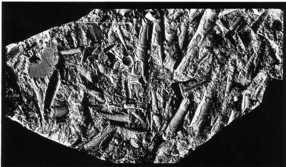
Fig. 4. Cephalopod limestone from the lower part of the Middendorf Formation, Ludlow, uppermost Gorstian. Section at Middendorf Cave, Tajmyr Peninsula; \times 2 .

tailed list of taxa resembles that of a fauna previously found in the Caucasus (Yanishevsky 1918; Nikiforova & Obut 1965). The Karabutak Formation rests discordantly on an eroded surface of Ordovician and Lower Silurian rocks and is overlapped by Lower Devonian clastic rocks.