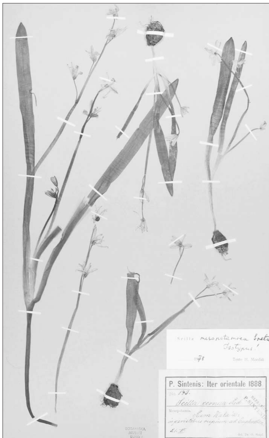
Fig. 1. The isotype of the Scilla mesopotamica Speta (LU herbarium, Sweden)