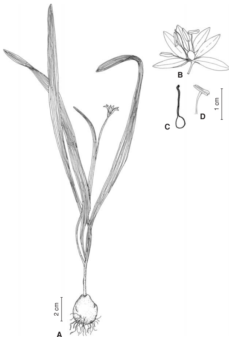
Fig. 3. Scilla mesopotamica Speta (drawn according to Eker 699): A – habit; B – perianth; C – pistil; D – stamen.