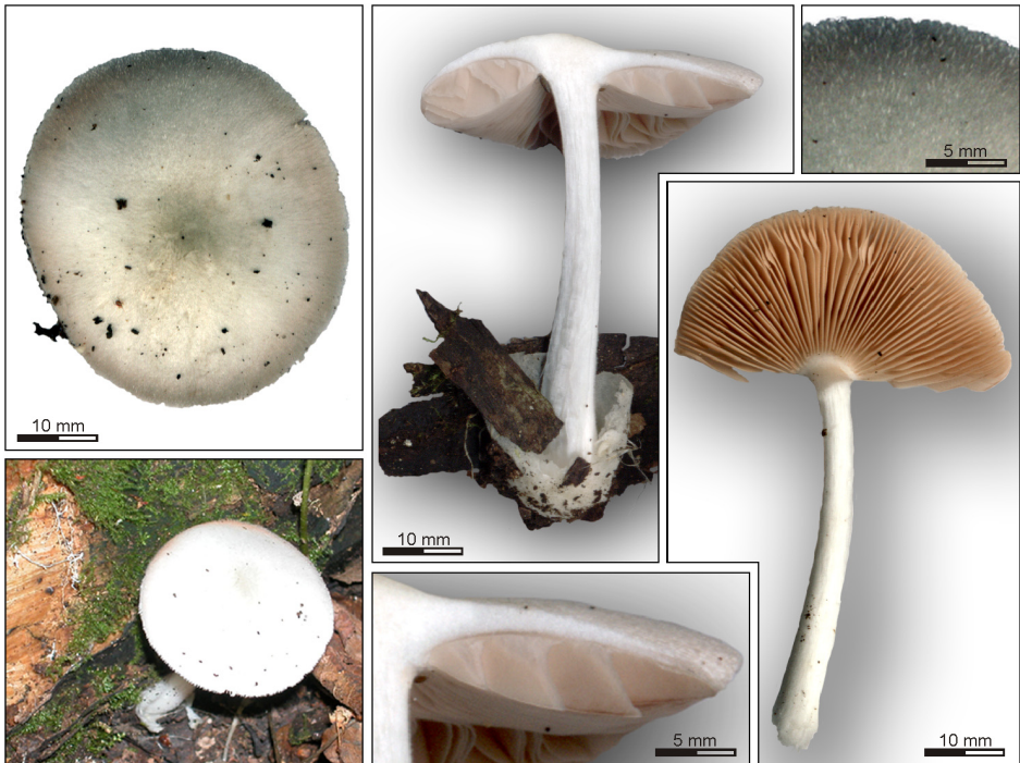
Fig. 2. Fruitbody of Volvariella caesiotincta recorded in Wrocław (22. July 2002).