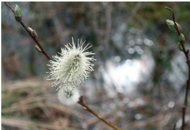
Fig. 4. Salix lapponum blooming male individual.