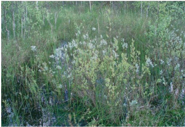
Fig. 2. Phytocenosis with Salix lapponum on peat-bog near Bikcze Lake.