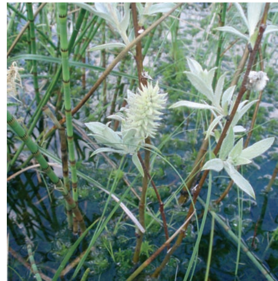
Fig. 5. Fructification of Salix lapponum .

czyńskie. Fijałkowski (1958) recorded the occurrence of S. lapponum in small groups from 10 to 50 specimens on the peat bog near Lake Bikcze.