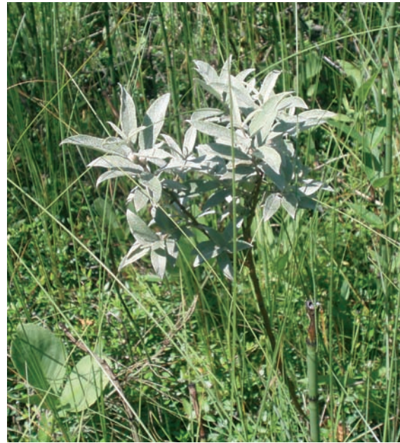
Fig. 3. Salix lapponum specimen in studied area.