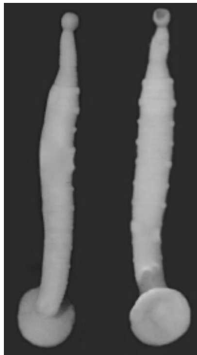
Phot. 3. Nototheniobdella sawyeri , dorsal and ventral view (A. Bielecki)