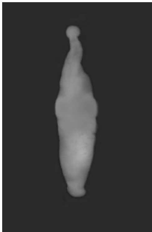
Phot. 4. Cryobdella sp. n., dorsal view

The fishes studied were found to support the following three leech species: Trulliobdella capitis (Phot. 1), Cryobdella antarctica Epstein, 1970 (Phot. 2) and Nototheniobdella sawyeri Utevsky, 1993 (Phot. 3). Some Cryobdella individuals were