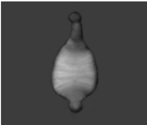
Phot. 1. Trulliobdella capitis , dorsal view (A. Bielecki)