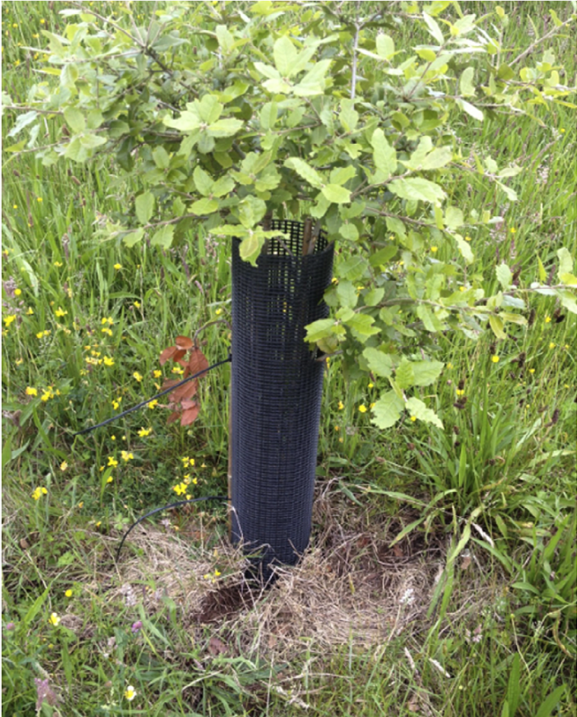
Fig. 1 Quercus ilex host tree from the UK study site in Monmouthshire. The impact of Tuber melanosporum mycorrhiza on the surrounding vegetation is apparent as an area of deceased grassland species.