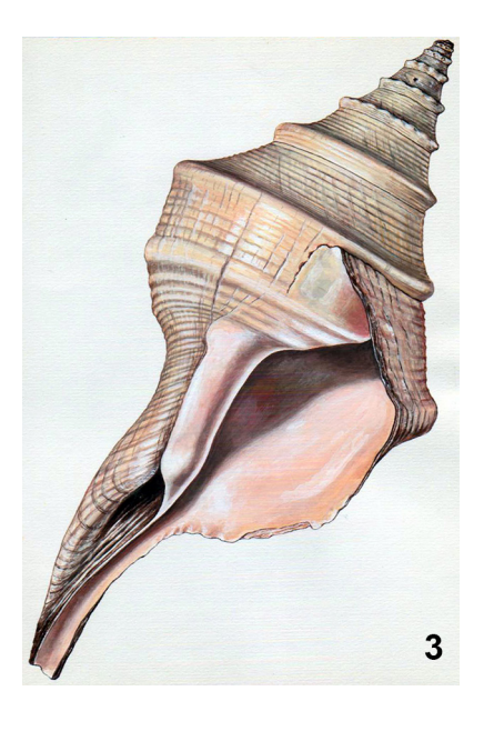
Figs 1-3. Gouaches by Andrzej Samek