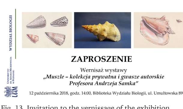
Fig. 13. Invitation to the vernissage of the exhibition

Night" organised on September 28th, 2018 (Fig. 15), an estimated number of 10,000 young people visited the exhibition. Similar attendance is expected during "the Biologists' Night" to be organised on January 11th, 2019.