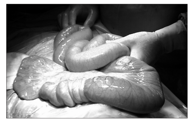
Figure 1 Intussusception of small bowel

Numerous enlarged lymph nodes in the whole mesentery of the small bowel were discovered. No other patological changes were discovered within the abdominal cavity. Resection of the tumour with a part of the jejunum about 20 cm in length and 'end-to-end' anastomosis was performed. The histological specimen and several small bowel mesenterial lymph nodes were sent for pathological examination. After dissection of the lesion, a pedunculated tumor covered by the normal serous membrane was discovered (Fig. 2).