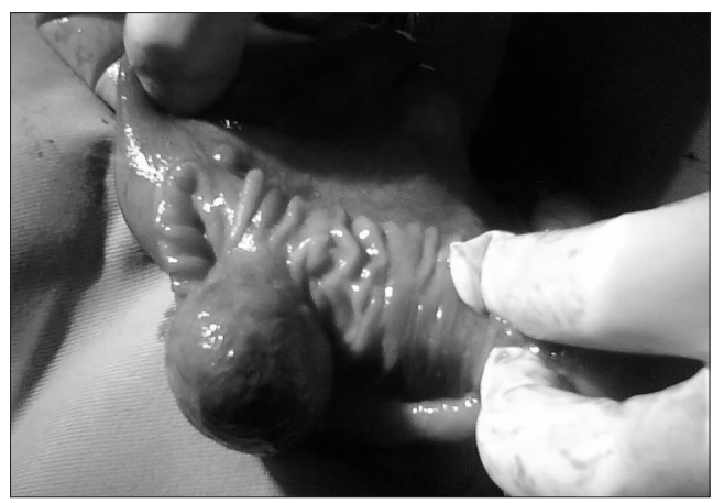
Figure 2 Pendunculated inflammatory fibroid polyp

Numerous enlarged lymph nodes in the whole mesentery of the small bowel were discovered. No other patological changes were discovered within the abdominal cavity. Resection of the tumour with a part of the jejunum about 20 cm in length and 'end-to-end' anastomosis was performed. The histological specimen and several small bowel mesenterial lymph nodes were sent for pathological examination. After dissection of the lesion, a pedunculated tumor covered by the normal serous membrane was discovered (Fig. 2).