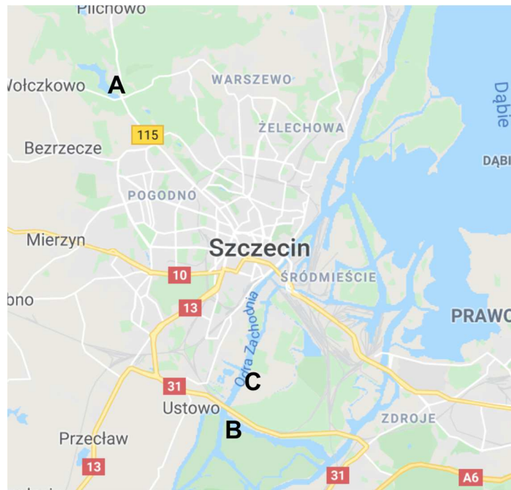
Fig. 1. Water sampling point