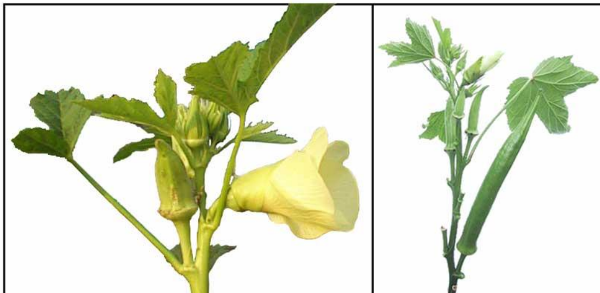
Photo 2. Abelmoschus esculentus L.