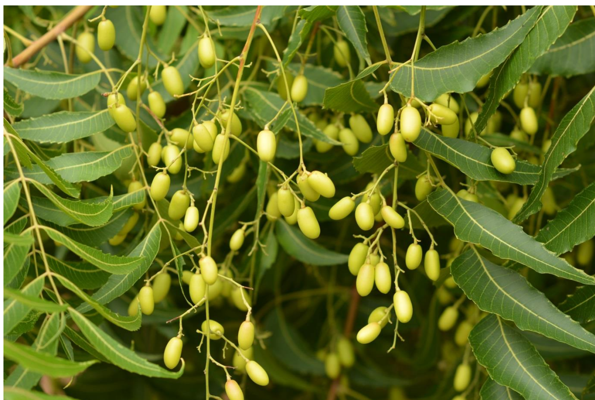
Photo 1. Azadirachta indica L.

Thus the present investigation was carried out to study the allelopathic effect of Azadirachta indica L. plant extracts on the germination, growth and Biochemical properties of Abelmoschus esculentus (L) Moench.