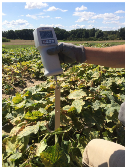
Fig. 1. Sauter FK 100 force gauge and fruit holder.