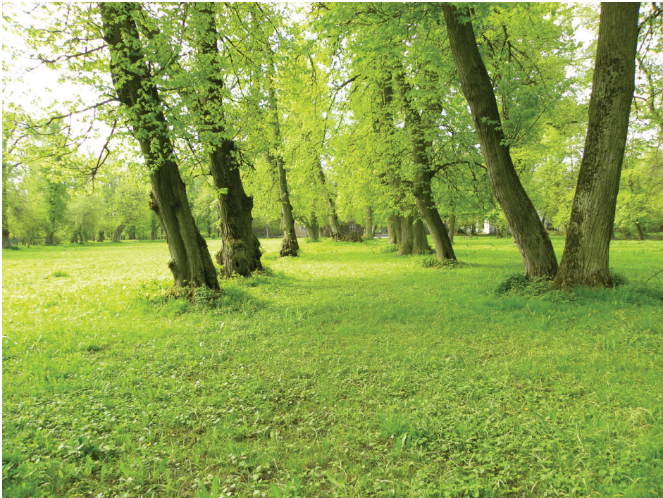
Photo 1. A fragment of the composition of the eighteenth's century park (M. Dudkiewicz)

the palaces, most of which were built on the hills, on the sunlit side. The location was advantageous for health (place on a hill – airy and sunny), favorable to farm management (proximity to water and easy communication), and emphasized the prestige of the owner (the view of the city Łęczna). The property was a vantage point and dominated over the city. It was located in a strategic position in terms of defense and it was the most beautiful one as well. The park still has a very good exposure in the landscape. It smoothly changes into the Wieprz valley landscape. The park is closely related to the panorama of the city viewed from the side of Lublin.