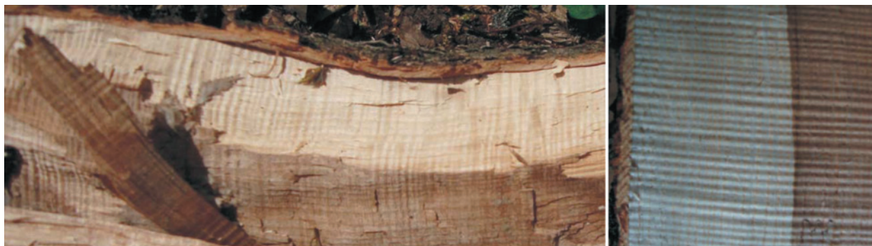
Figure 1. The wavy-grained wood of common ash growing in Ukraine

teristics (Yatsenko-Khmelevskyy 1954; Rioux et al. 2003; Vintoniv et al. 2007; Sopushynskyy 2006, 2012).