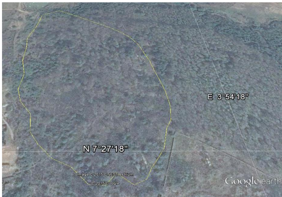
Picture 2. Google earth showing the map of Onigamabri forest reserve (within the yellow line is the natural forest zone)