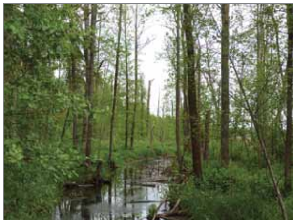
Figure 1. Alder decline along Krynica river in Białowieża forest district

ter discs were removed, and plates with medium were incubated for next 5 days. Every day, plates were investigated, and pure isolates were subcultured on fresh PARPNH medium. Further cultivation of pure cultures was done on V8 agar medium at 22°C.