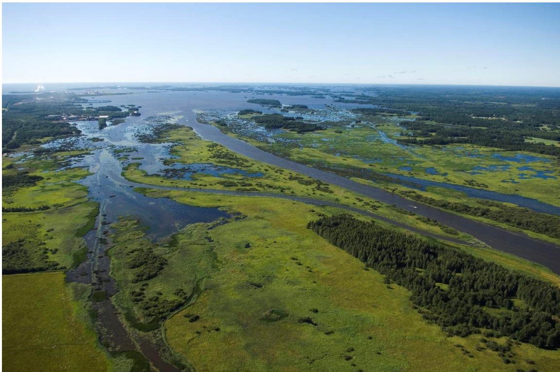
Figure 3. Aerial view of the Pihlavanlahti Bay, July 2007.