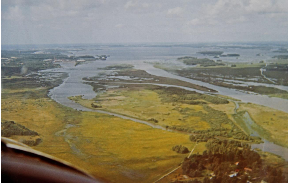
Figure 2. Aerial view of the Pihlavanlahti Bay in mid 1970's.