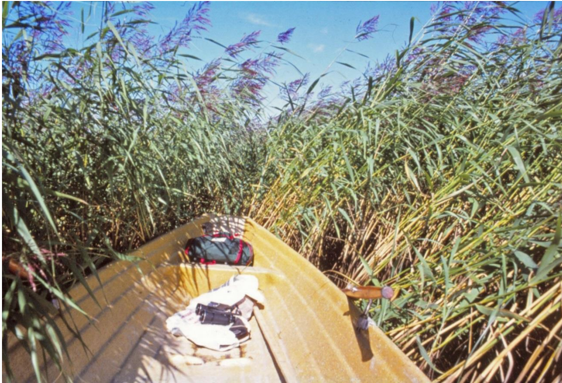
Figure 4. The stands of helophytic macrophytes are impenetrable. The common reed Phragmites australis is the dominant species in the proximal and middle sections of the Kokemäenjoki River delta.

The production capacity of Phragmites australis in the Kokemäenjoki River delta is very high, although the annual production of aboveground biomass up to over 5 kg (dry weight) per square meter is only a small-scale curiosity [36].