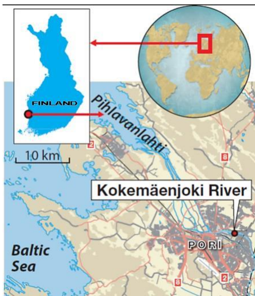
Figure 1. Location of the study area.

The Kokemäenjoki River estuary – Pihlavanlahti Bay – in western Finland (Northern Europe; 61°34'N, 21°40'E; Figure 1) is brackish water–freshwater ecosystem, where the deposition of river-borne sediments, the land upheaval, and the accumulation of autochthonous, locally produced plant material is more rapid than in any other river delta in the Northern Europe [1,2]. The estuary, discharging into the Bothnian Bay, the northern section of the Baltic Sea, is a shallow sedimentation basin, which is nearly thoroughly covered with rich and exceptionally productive macrophytic vegetation [3,4]. The delta in the estuary is proceeding very rapidly due to the deposition of sediments carried by the River Kokemäenjoki, the accumulation of autochthonous organic (plant) matter, and due to land uplift, typical to the shores of the Baltic Sea. At present, the extent of the land uplift in the area is 5.5 millimeters a year. The deltaic deposits (formation of new sandbanks and islands), as well as the distribution of the vegetation zones are today moving towards the sea at an average speed of 30-40 meters a year [5,6].