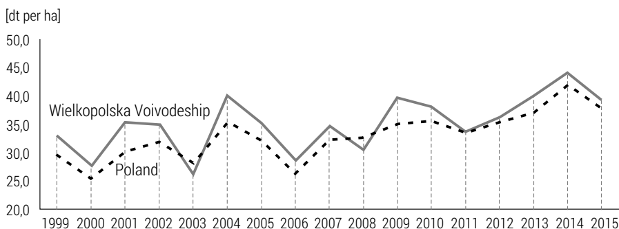
Figure 1. Variation of basic cereals' yield in years 1999–2015 in Poland and Wielkopolska Voivodeship

An important stage on the way to achieving this research objective is updating the normative size of the yields of cereals assigned to soil valuation classes and agricultural soil suitability complexes based on literature sources. The update of crop yield indices was necessary due to the progressive, gradual increase in the average size of the cereal yield at its very high annual fluctuations 8 , which is confirmed by statistical data about varied yields of basic cereals in the years 1992–2015 (figure 1).