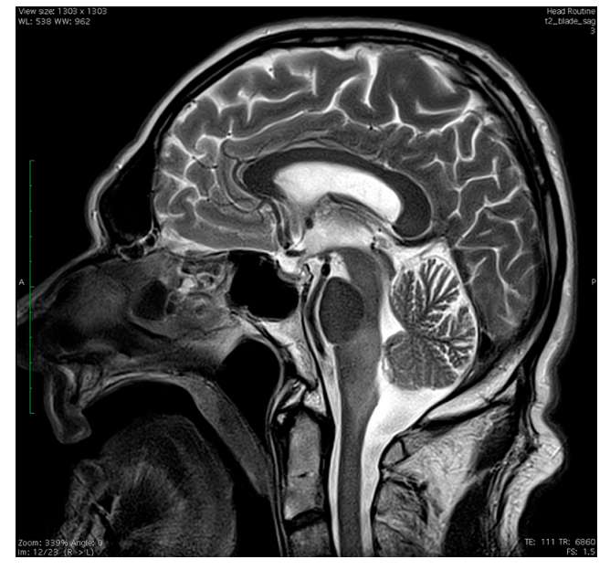
Figure 1. T2 weighted MRI sagittal image. A hyperdense poorly-demarcated focus which was not enhanced after paramagnetic administration. Change is seen mostly in the lower medulla and higher

Urszula Skrobas, Whitley-Smart Zie, Joanna Bielewicz, Konrad Rejdak. The rapidly progressing and fatal outcome of rhombencephalitis by listeriosis in a 61-year-old male