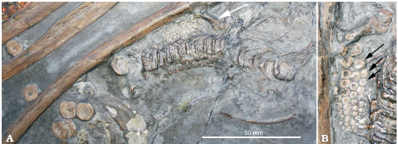
Fig. 7. Embryo of Ichthyosaurus somersetensis Lomax and Massare, 2017 (NLMH 106234) from the Lower Jurassic (lower Hettangian) of Doniford Bay, Watchet, Somerset, UK. A. Articulated vertebral column, isolated forefin, probable scapula (white arrow), ribs, and isolated centra. B. Close-up of the forefin. Arrows point to probable notching of the ?radiale, ?distal carpal, and ?metacarpal.

Four primary digits are evident, although a fifth primary digit may be present, indicated by a possible distal bifurcation (Fig. 7B). It appears that the ?radiale, ?distal carpal, and ?metacarpal are notched. This may, however, be an artefact of preservation (Fig. 7). All of the forefin elements are highly cancellous, displaying a spongy texture. The rim of many of the phalanges possesses a “bottle-cap” like morphology, suggestive of poorly ossified bone, or perhaps calcified cartilage. Similar preservation is also present in very small examples of Ichthyosaurus (e.g., BU 5289). A large element, proximal to the fin, is too long to be the humerus and is probably the scapula, which is expanded proximally.