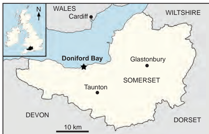
Fig. 1. Map of Somerset including the location of Doniford Bay (indicated by a star), Watchet, UK.

plete skeletons (Lomax and Massare 2017). In fact most Ichthyosaurus specimens found in Somerset belong to this species (Lomax and Massare 2017; DRL personal observation). The studied specimen provides new information on the morphology of the pelvis and hindfin of the species, along with the size range of the genus.