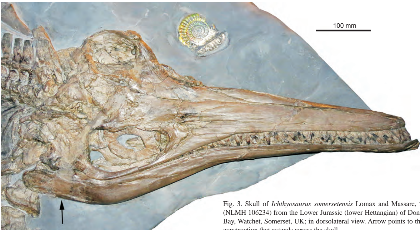
Fig. 3. Skull of Ichthyosaurus somersetensis Lomax and Massare, 2017 (NLMH 106234) from the Lower Jurassic (lower Hettangian) of Doniford Bay, Watchet, Somerset, UK; in dorsolateral view. Arrow points to the reconstruction that extends across the skull.

accounting for the missing centra, would add roughly 15 cm to the precaudal length, giving a total of 122 cm. Buchholtz (2001: fig. 5) showed that the tail stock (pelvis to bend in the tail) for Ichthyosaurus is about 60% of the precaudal length, which would suggest a tail stock length of approximately 73 cm for NLMH 106234 (i.e., a preflexural total length of 195 cm, not including the skull). For comparison, the tail stock is 56% of the precaudal length in the holotype of I. somersetensis (ANSP 15766). NHMUK OR2013*, a referred specimen of I. somersetensis , has a total length from tip of snout to tip of fluke of 268 cm, including a fluke length of ~ 40 cm. Considering the size of the studied specimen, it is probable that the fluke length may have been as much as 50 cm. Adding this fluke length and the skull length to the estimated preflexural length of NLMH 106234, suggests an animal with a total length of just over 300 cm (Table 1).