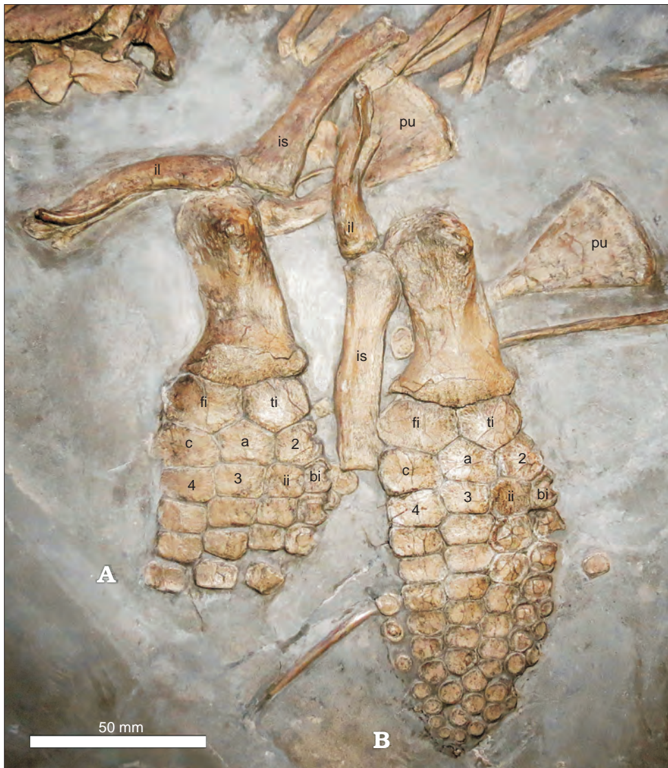
Fig. 6. Hindfins and pelvis of Ichthyosaurus somersetensis Lomax and Massare, 2017 (NLMH 106234) from the Lower Jurassic (lower Hettangian) of Doniford Bay, Watchet, Somerset, UK. The right hindfin (B) is the more complete of the two, exposed in dorsal view. The left hindfin (A) is in ventral view. Abbreviations: 2, tarsal two; 3, tarsal three; 4, tarsal four; a, astragalus; bi, bifurcation; c, calcaneum; fi, fibula; ii, metatarsal 2; il, ilium; is, ischium; pu, pubis; ti, tibia.

exposed in dorsal view, whereas the left hindfin is exposed in ventral view. The femur is long relative to its distal width. Its anterodistal end has an anterior facet and the posterodistal end is expanded posteriorly. The dorsal process is offset anteriorly. The ventral process is more centrally located, but is slightly offset anteriorly. The fibula is anteroposteriorly wider than the tibia but is proximodistally about the same length. Tarsal 2, the first element of the bifurcation, and the first two phalanges are notched, although the shape of the notch differs, as has been reported in some specimens of Ichthyosaurus (Massare and Lomax 2016a: fig 10). There is one element (tarsal 3) in broad contact with the astragalus. However, a bifurcation of tarsal 2 is present, which results in four elements in the third row. We identify the anterior branch of digit II as the bifurcation. A small portion of metatarsal 2 contacts the astragalus. This differs from the condition described by Lomax and Massare (2017), who found that I. somersetensis had only one element (tarsal 3) directly in contact with the astragalus, with three elements in that row, and a bifurcation in a more distal row. In NLMH 106234, a