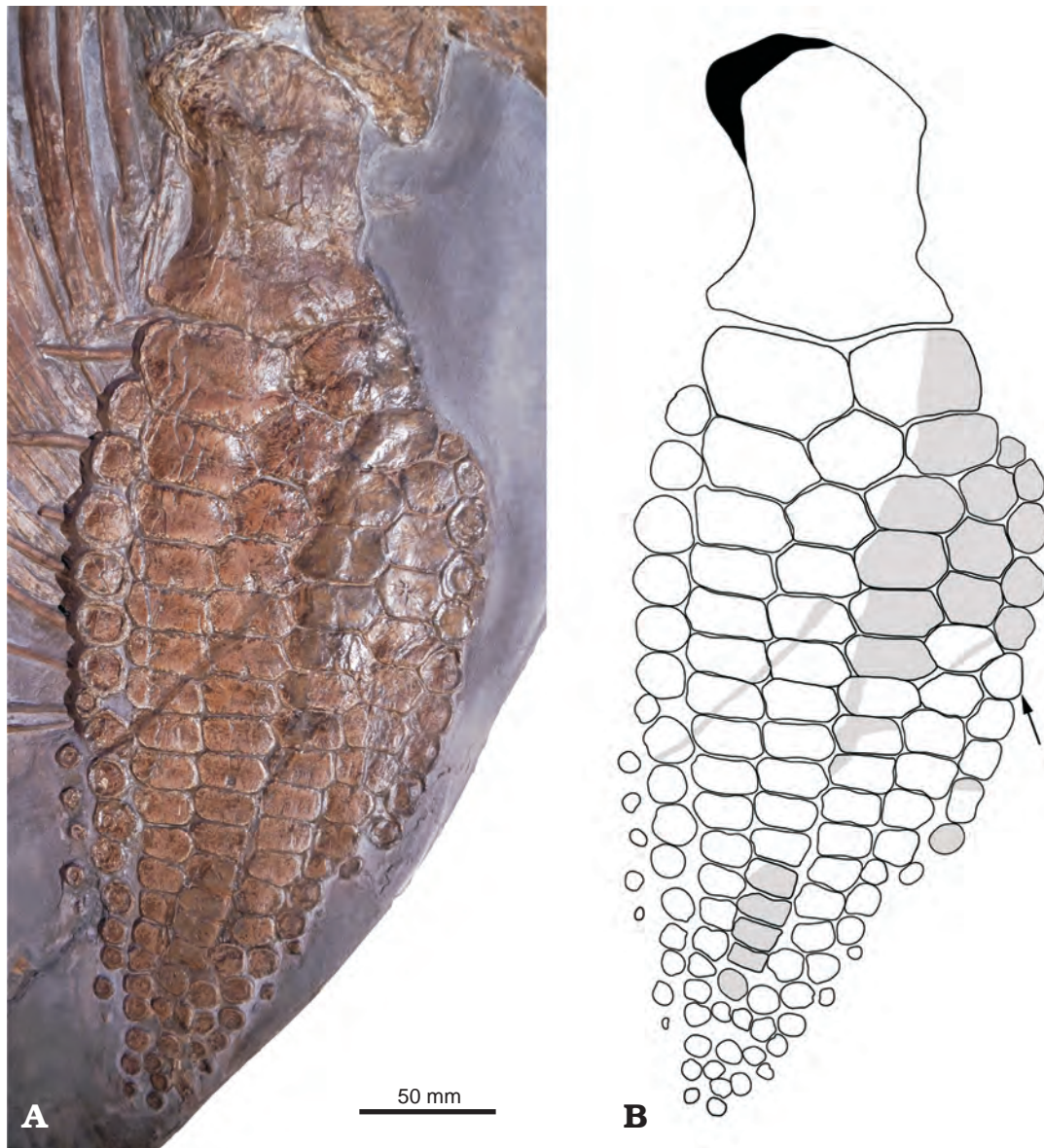
Fig. 4. Right forefin of Ichthyosaurus somersetensis Lomax and Massare, 2017 (NLMH 106234) from the Lower Jurassic (lower Hettangian) of Doniford Bay, Watchet, Somerset, UK; in dorsal view (anterior to the right). Grey indicates plaster filler (elements are not genuine); black indicates crushed and displaced portion of humerus. Arrow points to bifurcation. Photograph (A), explanatory drawing (B).

tary skull (IRSNB R145) from the upper Sinemurian of Bonnert, Belgium (Godefroit 1996). Massare et al. (2015) suggested that the Frick specimen could not be assigned to Ichthyosaurus , whereas the Bonnert specimen was identified as cf. Ichthyosaurus . This is contrary to Massare and Lomax (2017a), who erroneously referred both specimens to the genus. We agree with Massare et al. (2015), pending detailed examination of the European specimens.