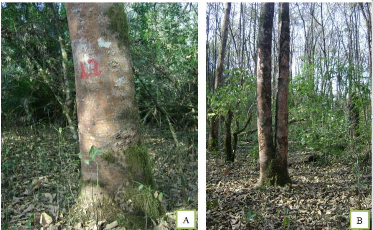
Figure 1. Gmelina arborea trees with clear (A) and forked (B) boles at Central Ethiopia Environment and Forest Research Center growth trial research station at Bonga-Keja.

Bonga-Keja site located 449 km from Addis Ababa and 6 km west of Bonga town on the way to Mizan. Bonga belongs to SNNP (South Nations Nationalities and People) region of Ethiopia. Bonga site has an altitude of 1700 m, latitude 07°16 and longitude 36°15. The site has mean annual rainfall of 1700 mm and mean annual temperature of 21 °C [16]. In Ethiopia, Gmelina arborea available at CEE-FRC growth trial research sites of Bonga, Bebek, Tole Kobo, Aman [16].