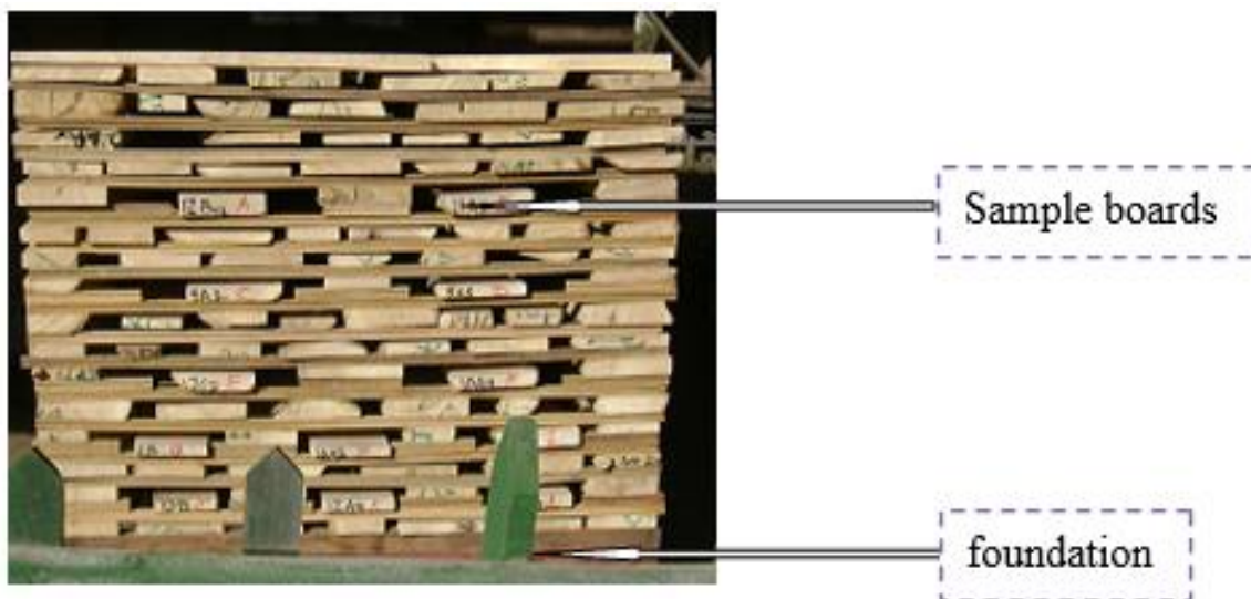
Figure 3. Seasoning stacks of Gmelina arborea . [Photos collection by Getachew D.].

Stacking sawn boards: Sawn boards were transported to the air seasoning yard and compartment kiln-seasoning chamber (Figure 3) areas. Boards of the species were stacked horizontally in vertical alignments separated by well-seasoned, squared, uniform sized standard stickers with 3 cm spacing between successive boards. The stickers were placed at an equal distance across each layer of lumber aligned one on top of the other from bottom of the stack to the top. This alignment helped to separate boards, facilitate uniform air circulation, minimize warp, avoid stain and decay occurrence during the seasoning process. The dimension of stickers adapted from Sweden standard.