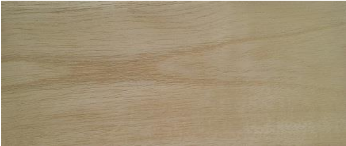
Figure 4. Lumber pictures of study tree species at Forest products Development and Innovation Research and Training Center sawmill before stacking.

with a pinkish tinge appearance. Whereas the sapwood has a whitish, a greenish or yellowish tinge appearance (Figure 4) with a 5-7 cm wide. The grain is straight to interlocked, while texture is coarse. Growth rings are distinct in regions with a marked dry season, but not distinct in other regions. The wood is somewhat oily to the touch as [5] indicated.