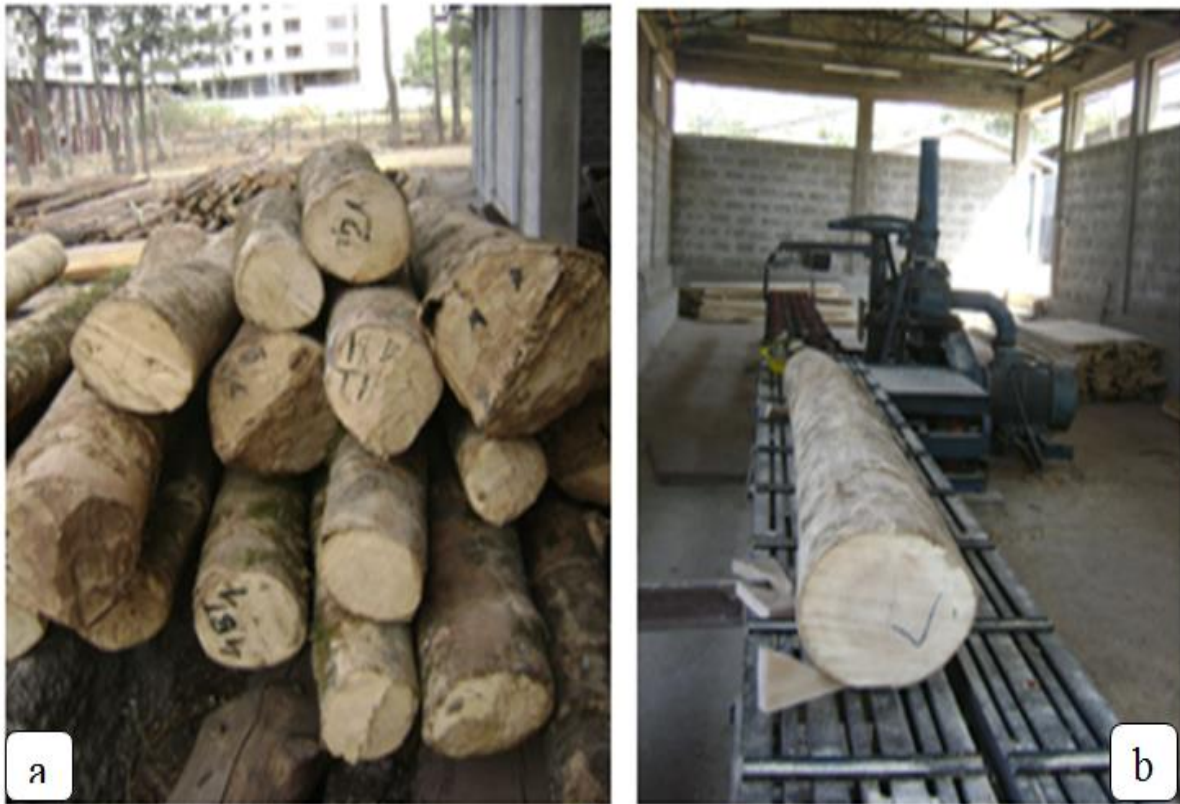
Figure 2. Gmelina arborea logs (2a) arranged for sawing (2b).