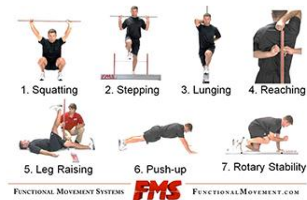
Figure 1. FMS tests

The Functional Movement Screen™ (FMS™) is a new tool used for testing and evaluating basic human movement patterns in order to identify restrictions or asymmetry that could predetermine the possibility of injury to the tested subject. Incorrect movement patterns can seriously compromise the effectiveness of training as well as overall fitness and health [13].