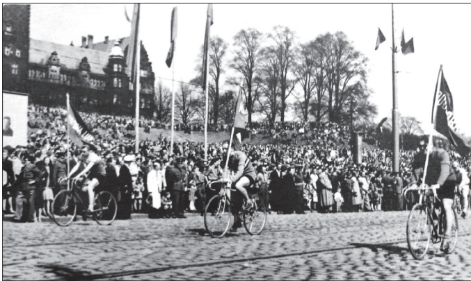
Figure 2. Leading Szczecin cyclists on the March of the 1st May on Waly Chrobrego in Szczecin, beginning of the 1950s

meetings, 1949, p. 100). Since 1950, sports clubs at the workplace and the District Councils of Sports Associations, related to specific trade unions, have been organized (APSz, Marshall Office in Szczecin – UWS, file number 1383, Associations and Unions, 1949–1950, p. 122). One of the consequences of such policy was the actual mass popularization of physical culture, often forcefully, as well as the fragmentation of the potential of competitive sport. While mass popularization of sport was easy to carry out in large cities, similar activities faced numerous problems in the rural environment. In addition to the lack of trained staff, there was simply a shortage of equipment. Programs and declarations were prepared, but usually had no realistic follow-up (“Kurier Szczeciński”, 1949, No. 50). Moreover, it was easier to attract athletes for political demonstrations, parades on “the holiday of the working class” on May 1, or “People Holiday” (July 22) than to materially support the development of competitive sport.