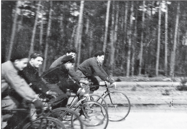
Figure 3. Cycling tour of Szczecin's competitors in 1949