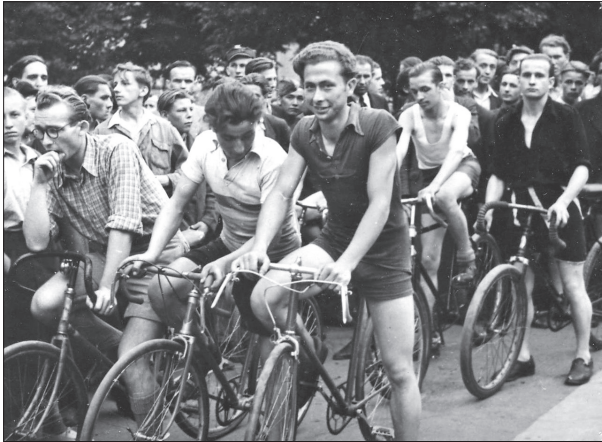
Figure 1. Before the start of the race around Jasne Błonia on August 11, 1946