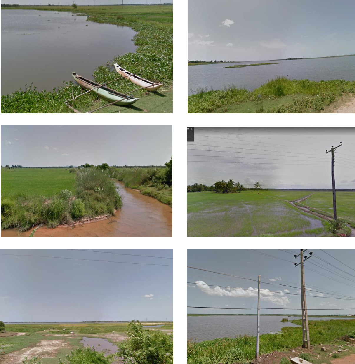
Figure 3. Field survey, 2017

The employment types in Navithanveli DS Division are agriculture, business, service sector and other as 80%, 15%, 4% and 1% respectively. As an agricultural area, Navithanveli is extensively engaged. Majority of the wetlands are used for the paddy cultivation.