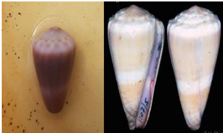
Figure 7. Conus sp. (left) Observation Results; (right) Literature Figure (Hwass 1972)

The last species found as, albeit, 1 individual is Conus sp. This stays active at night and usually hides in sand type substrates during the day. This species is a gastropod known as a toxic invertebrate. The color patterns and the shape of this gastropod can indicate the quality of its habitat, as this highly influence the brightness of the snail's body.