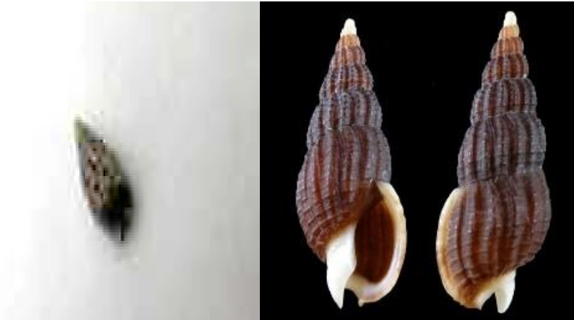
Figure 4. Nassarius sp. (left) Observation Results; (right) Literature Figure (Linnaeus, 1758)

Another species found in the May period is Nassarius sp. This is a specimen that has a cone-shaped shell that is twisted. This type of gastropod is found on the substrate of fractional corals or dead corals and can live in the area of intertidal sands and mud flats.