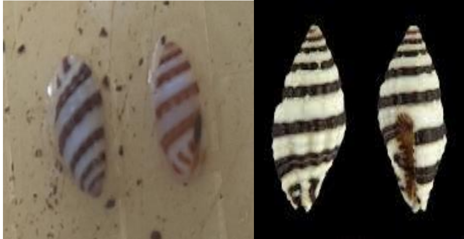
Figure 5. Engina zonalis . (left) Observation Results ;(right) Literature Figure (Lamarck 1822) (from marinespecies.org)

Order: Neogastropoda Family : Pisaniidae Genus: Engina