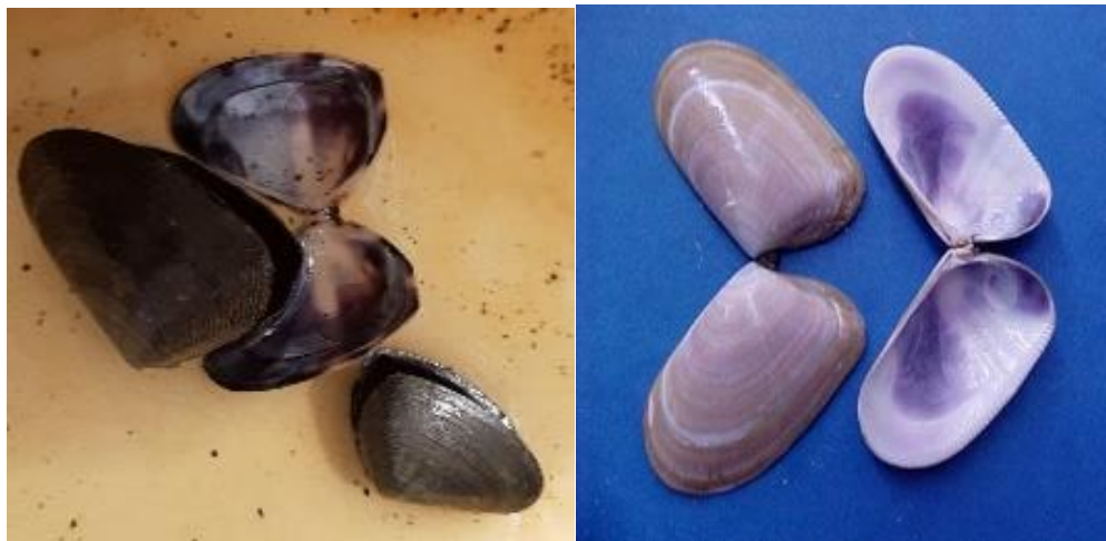
Figure 3. Donax sp. (left) Observation Results; (right) Literature Figure (Linnaeus 1758) (from marinespecies.org)

The two species evident in May include Donax sp. The mussels has a elliptical shape and a wide line in the shell. A filter feeder, it feeds on phytoplankton and detritus suspended in seawaters. Its vertical spread is related to the ability to dig into the substrate, while, horizontally, its movement is over the surface of substrates in the intertidal area. It lives in sand type substrates.