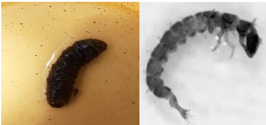
Figure 6. Engina zonalis . (left) Observation Results; (right) Literature Figure (Holzenthal 2009)

Another species that was found is that of the larva of caddisflies (caddisfly) (order Trichoptera). This is a type of insect that in its lifecycle occupies two distinct ecosystems, the aquatic ecosystem and the terrestrial ecosystem. The larva phase of this species lives in freshwater with slow flowing currents and it feeds on detritus algae. Thus, it can be considered to be wash-in.