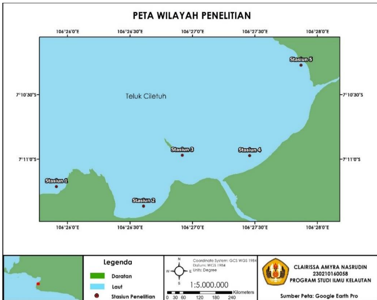
Figure 1. Research Study Area

The research area is located at Ciletuh Bay in Sukabumi district of West Java (geographical location – Figure 1, location coordinates - Table 1).