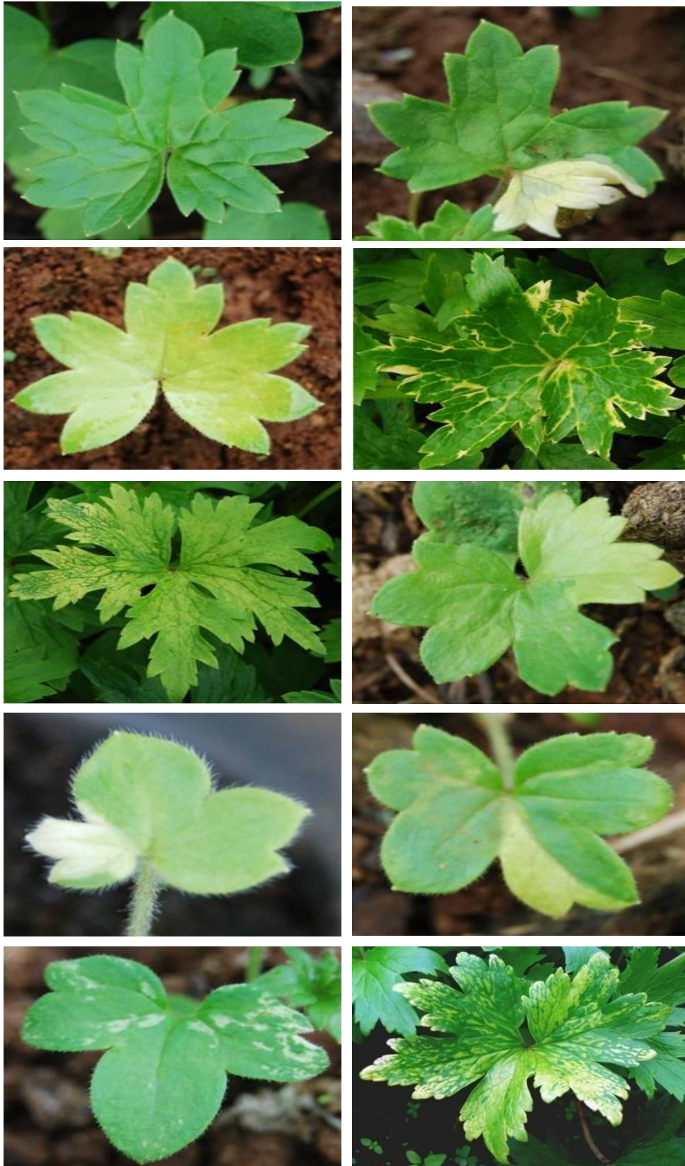
Fig. 1. Chlorophyll mutants in M_2 generation of Delphinium malabaricum (Huth) Munz. a – Control, b – Albina green, c – Aurea, d – Chlorina, e – Viridis, f – Yellow viridis, g – Tigrina, h – Striata, i – Maculata, j – Variegated