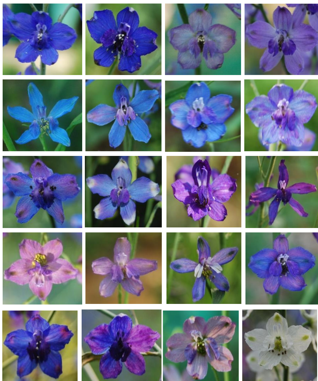
Fig. 2. Flower color mutants selected in M_2 generation of D. malabaricum . Control – a – blue flowers; Mutants – b-t: b – dark blue, c, d – light violet, e – fresh sky blue, f, g – sky blue with pink tinge, h, i – light blue with purple shade, j – blue with white tip, k, l – dark purple, m, n – light purple, o – blue with white petals, p, q, r – blue with purple shades, s – pale pink, t – white