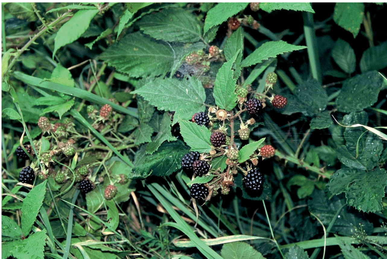
Fig. 8. Rubus clusii – fruitful shoot