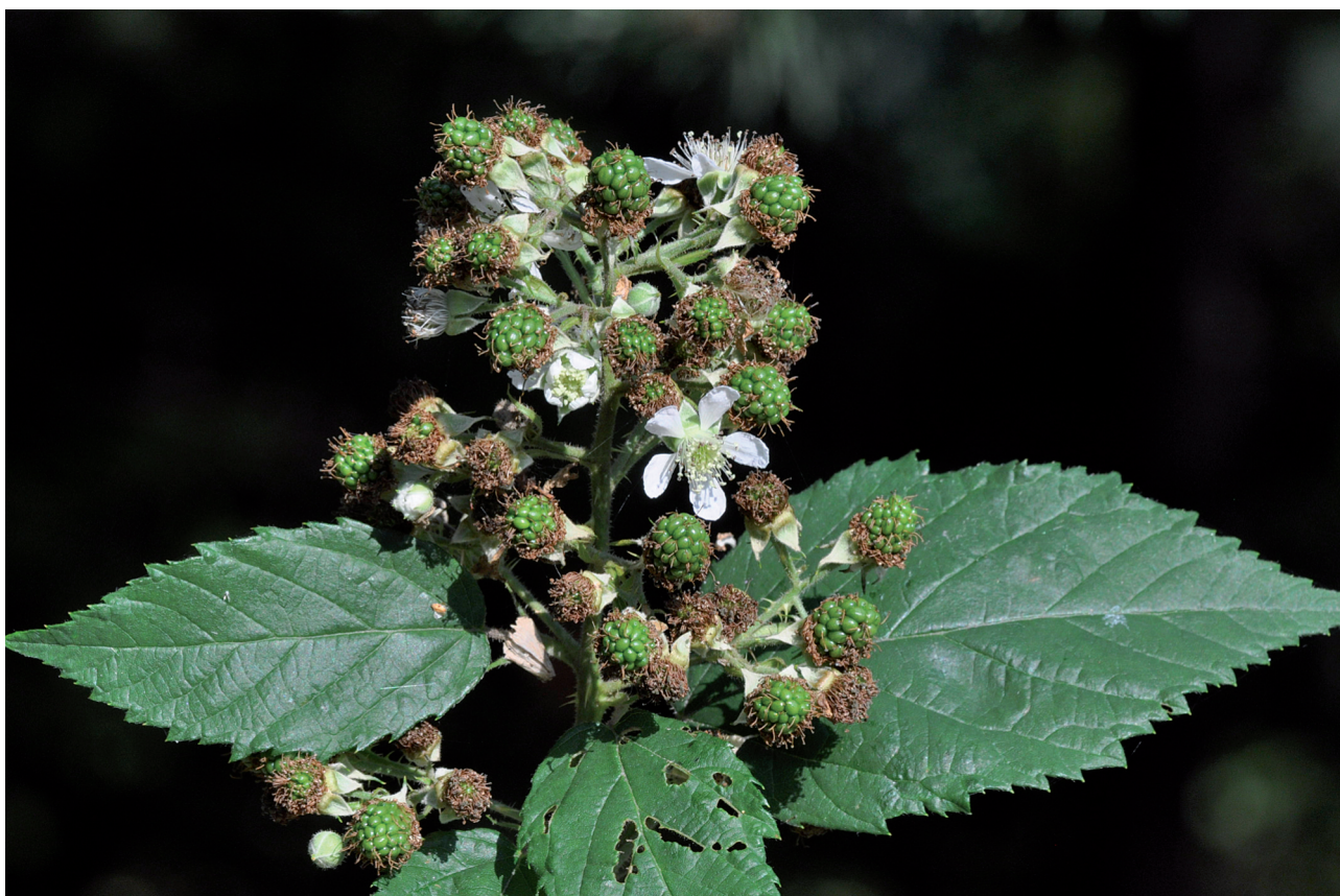
Fig. 6. Rubus clusii – inflorescence