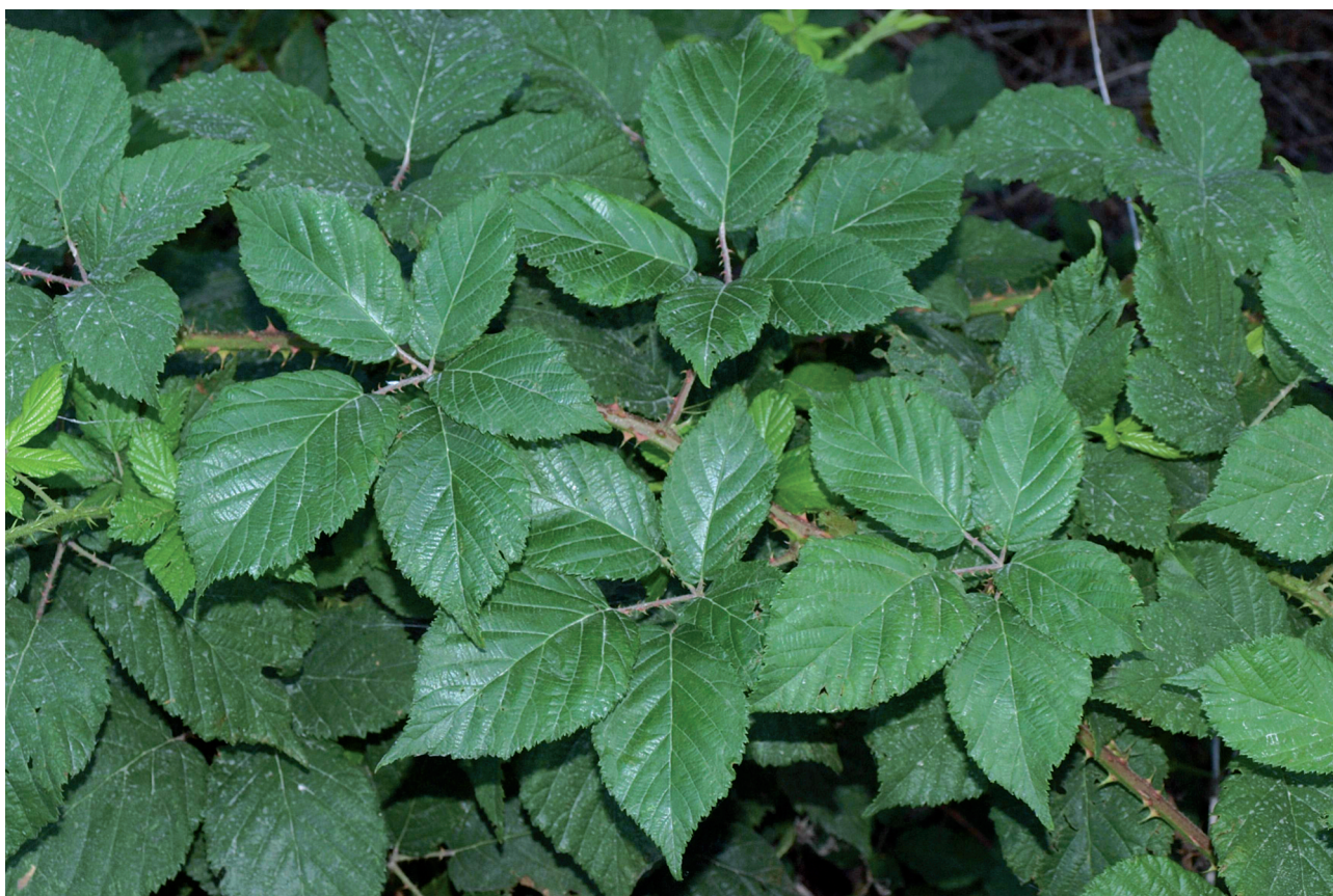
Fig. 4. Rubus clusii – leafy shoot