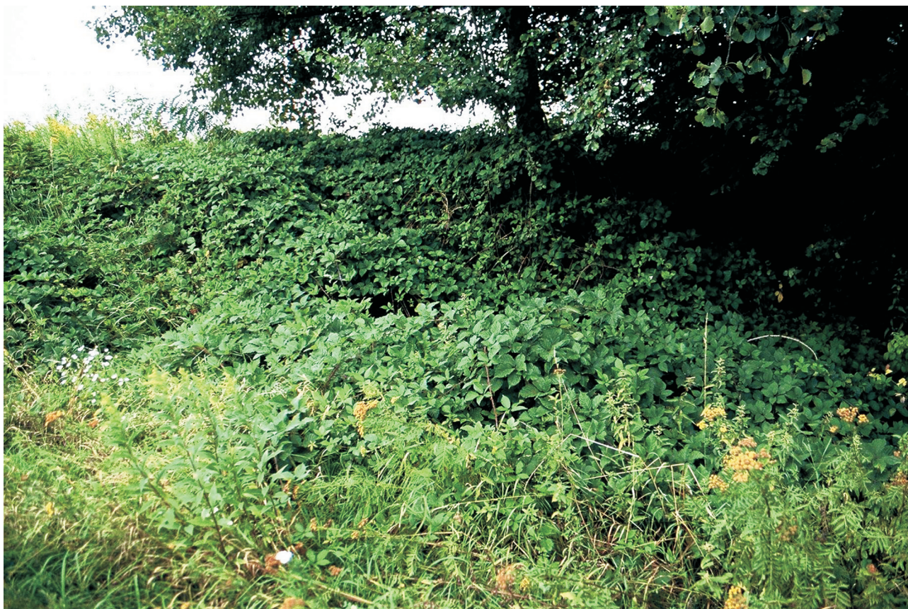
Fig. 3. Rubus clusii on the locality number 1 (photo K. Oklejewicz)