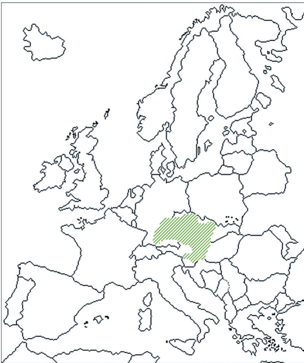
Fig. 1. New localities of Rubus clusii compared to its known range

with a gradually acuminate apex 8–15 mm long, \pm periodically serrate, serration 2–4 mm deep; teeth broad, apiculate, principal ones straight. Basal leaflets with petiolules 3–5 mm long. Petioles rather densely pubescent, with numerous stalked glands and 20–30 curved prickles. Stipules filiform. Inflorescence paniculate, usually narrow, almost cylindrical, leafy almost to the apex, with 3-foliolate leaves below (Fig. 6). Inflorescence axis with numerous simple and