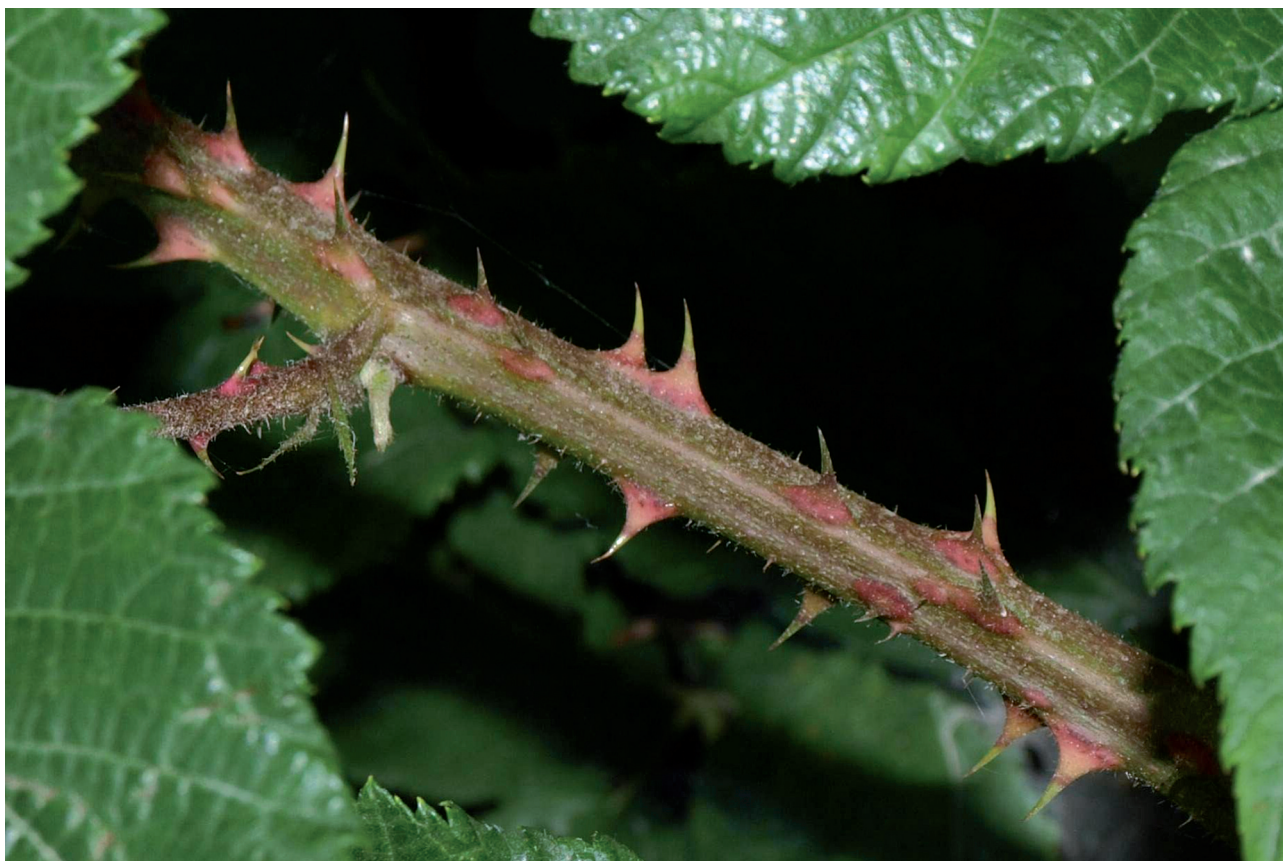
Fig. 5. Rubus clusii – stem