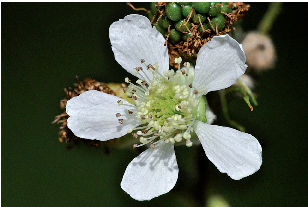
Fig. 7. Rubus clusii – flower