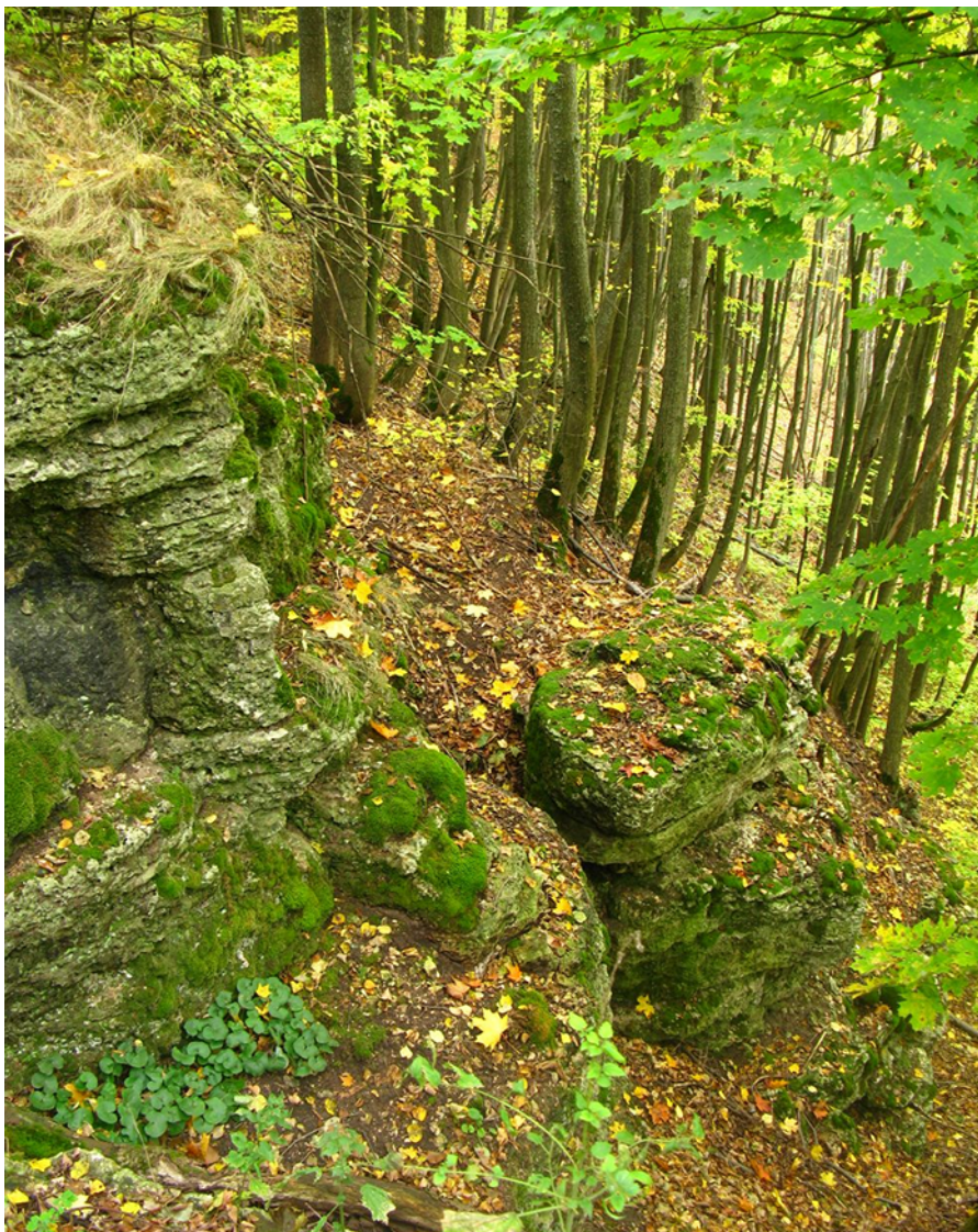
Fig. 2 Dead floor maple forest with lime trees in the Voronov Kamen protected area.

The Morozova Gora protected area is located on the east side of the Don River valley and covers approximately 3 km 2 . The major part of it is a plain (600 m at its widest), which becomes narrower and forms a valley while going from the north to the south. The vegetation comprises fragments of upland oak and birch forests, floodplain willow forests, meadows, and stipe-herb steppe fragments.