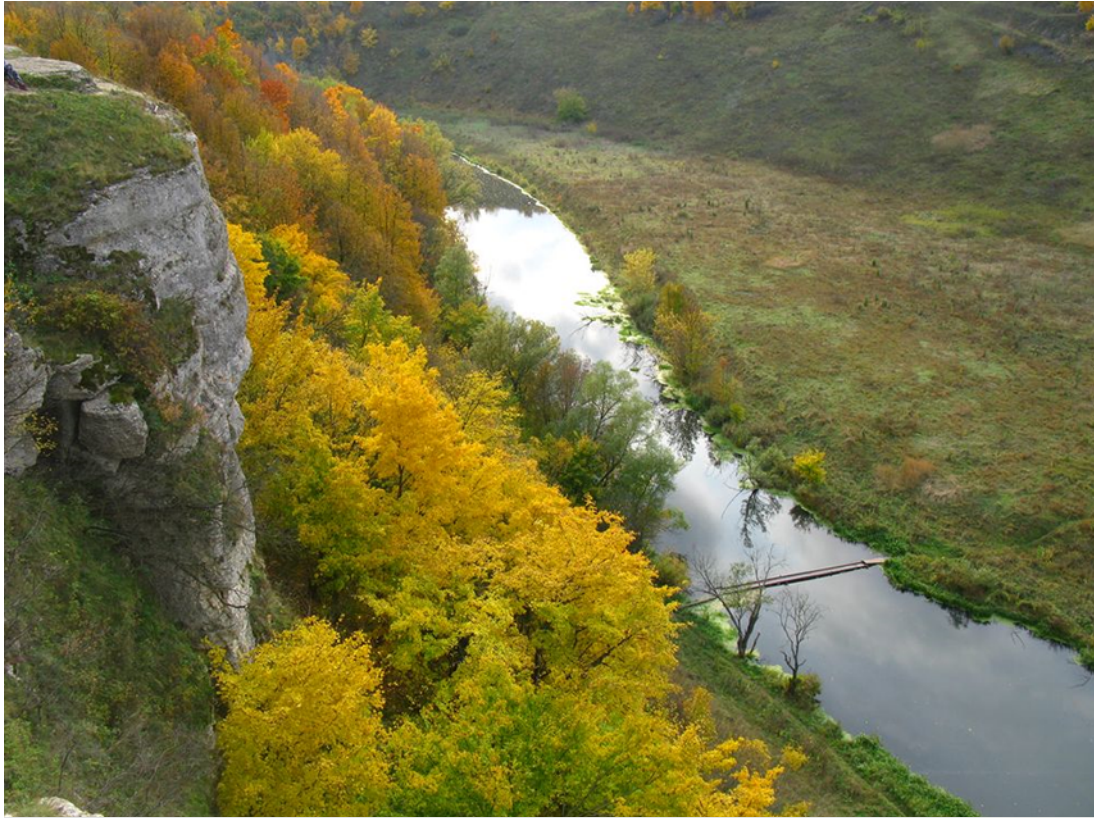
Fig. 3 Limestone-cliff outcrops on the bank of the Vorgol River.

Abbreviations of localities studied are as follows: