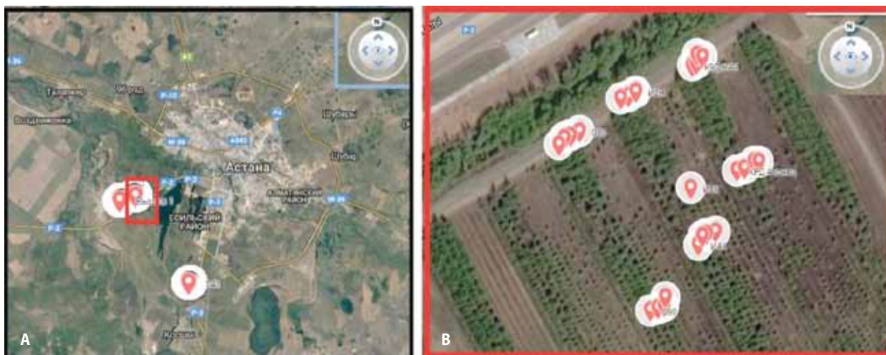
Figure 1. Trial areas laid in the green belt of Astana city A – general view of the location of trial plots, B – location in rows, 3 replicates

indicators and conditions of the site of occurrence. The plantations were planted in the north-west direction. Trial areas for common pine were laid in triplicate (Fig. 1).