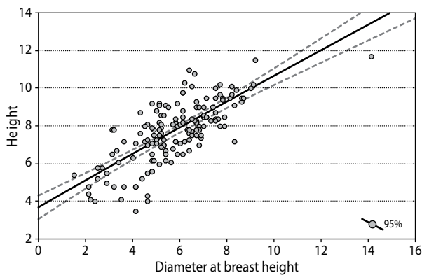
Figure 2. Correlation relationship of height and diameter at the breast height of stands of Scots pine

Figure 2 shows a linear correlation between the diameter at the breast level and the height of the planted pine.