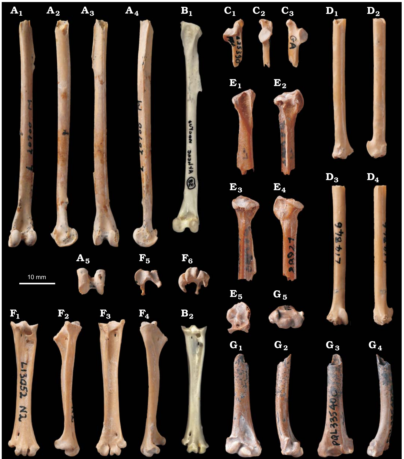
Fig. 2. Strigid owl Athene inexpectata sp. nov. from the early Pliocene, Upper Varswater Formation at Langebaanweg, South Africa; paratypes (A, C–E, G), holotype (F) and Athene noctua , Recent (B). A. Left tibiotarsus (SAM-PQ-L20700 M), in cranial (A 1 ), lateral (A 2 ), caudal (A 3 ), medial (A 4 ), and distal (A 5 ) views. B. Reversed right tibiotarsus (MGPT-MPOC 38), in cranial view (B 1 ), left tarsometatarsus in dorsal view (B 2 ). C. Left scapula (SAM-PQ-L25390 GA), in medial (C 1 ), cranial (C 2 ) and lateral (C 3 ) views. D. Right ulna (SAM-PQ-L14846), in dorsal (D 1 ), caudal (D 2 ), ventral (D 3 ) and cranial (D 4 ) views. E. Right tibiotarsus (SAM-PQ-L28927), in cranial (E 1 ), lateral (E 2 ), caudal (E 3 ), medial (E 4 ), and proximal (E 5 ) views. F. Right tarsometatarsus (SAM-PQ-L13052 N2), in dorsal (F 1 ), lateral (F 2 ), plantar (F 3 ), medial (F 4 ), proximal (F 5 ), and distal (F 6 ) views. G. Right humerus (SAM-PQ-L33540 C), in cranial (G 1 ), dorsal (G 2 ), caudal (G 3 ), ventral (G 4 ), and distal (G 5 ) views.