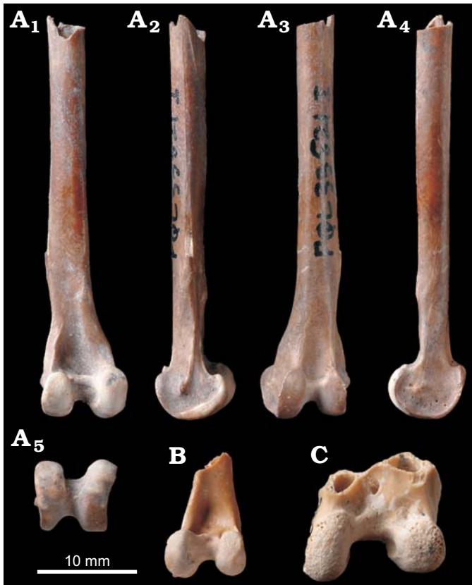
Fig. 3. Strigid owls from the early Pliocene, Upper Varswater Formation at Langebaanweg, South Africa. A. Asio sp. (SAM-PQ-L33521 I), right tibiotarsus, in cranial ( A_1 ), lateral ( A_2 ), caudal ( A_3 ), medial ( A_4 ), and distal ( A_5 ) views. B. Strigidae gen. et sp. indet. (SAM-PQ-L28479 C), left tibiotarsus in cranial view. C. Bubo sp. (SAM-PQ-L28439 C), left tibiotarsus in cranial view.