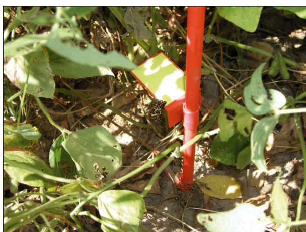
Fig. 2. Water sensitive paper cards at bottom of canopy

booms for each run. As it took about ½ hour to change booms and verify nozzle flow and proper operation, this was not practical. A modified plan was implemented by which the booms (nozzles) were changed every six runs, but their sequence was randomised. Direction of flight and spray release height were then randomised within the boom spraying the crop. The time of the field entry for each run was noted to-the-second using an atomic watch.