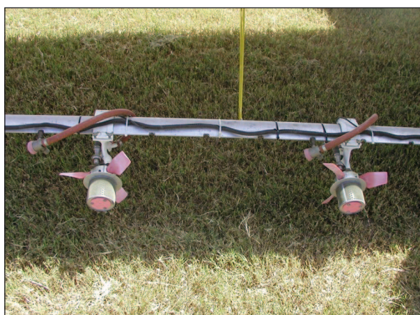
Fig. 3. CP®-09 and Accu-Flo® spray nozzles; Micronair® AU5000 rotary atomiser on spray booms