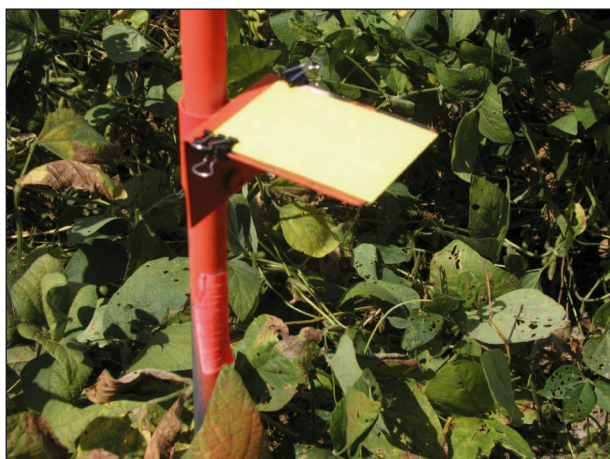
Fig. 1. Water sensitive paper cards at top of canopy