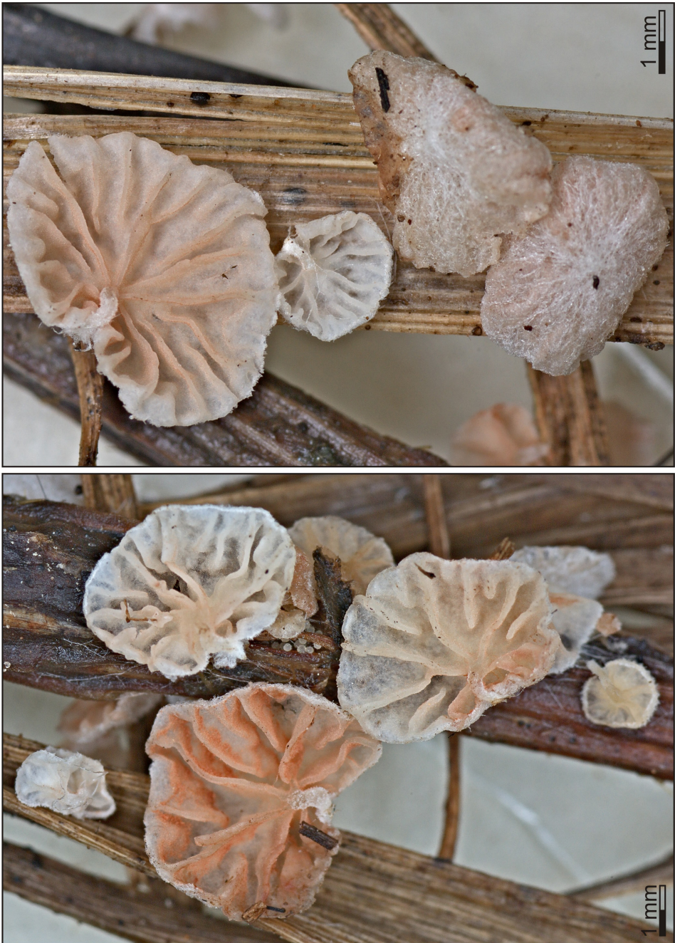
Fig. 2. Basidiocarps of Entoloma albotomentosum recorded at Domaszowice (coll. 14.08.2010;).