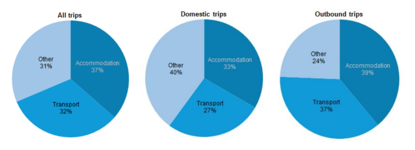
Figure 2. Expenditure by the kind of expenditure made by Europeans

The Table 1 presents some data connected with expenditure of tourists from Europe for travelling. [11] The residents of European Union spent in 2013 an estimated 416 billion Euro for tourist purposes. They spent 45 % of this on trips in their own country of residence, so on domestic tourism and 55% constitute travels abroad, so the outbound tourism. The highest percentage of total expenditure for domestic trips achieved Spain (72%), whereas tourist from German are likely to spend more on outbound travels (63%). The similar preferences have tourists from United Kingdom – only 38% of expenditure for domestic trips and the bigger