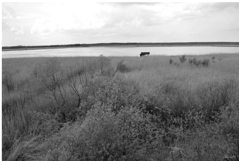
Figure 1. Świdwie Nature Reserve – Świdwie lake and wetlands around it

venly. The biggest number of SPAs are located in Lubelskie (20 areas), Zachodniopomorskie (19 areas), Mazowieckie and Warmińsko-Mazurskie (14 areas each) voivodships. Opolskie, Śląskie (3 areas each), Łódzkie (2 areas) and Świętokrzyskie (1 area) voivodships have the lowest number of SPAs. These areas are of different origin and land use, including forest, meadows, pastures, arable land, fallow land, lakes (fig. 1), reservoirs, fish ponds, marine waters and built-up areas. Their ornithofauna is also extremely varied, including many rare and endangered species (such as: aquatic warbler, greater spotted eagle, ruff, short-eared owl, roller) (Sterno, 2015, p. 26). In the Annex I to Directive Birds 180 species are listed (Dyrektywa Rady 79/409/EWG w sprawie ochrony dzikich ptaków, 1979). Poland is also a very attractive place to watch migrating and wintering geese (Sterno, 2015, p. 27). Moreover the Special Protection Areas differ in their status and existing forms of protection. Most of them interfere with the national parks, landscape parks, nature reserves, protected landscape areas and ecological sites.