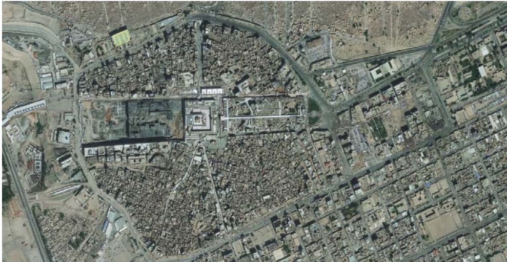
FIGURE 2. Aerial view of Al-Najaf Old City (Nasar, 2015)

it is imperative to preserve the heritage assets of the city and the integrity and vitality of the sacred centre (Directorate of Urban Planning of Najaf Governorate, 2006).