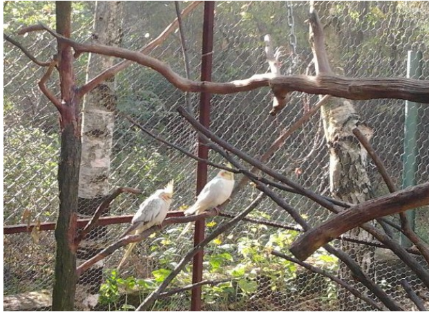
Phot. 1. The cockatiels in an aviary gregarious system