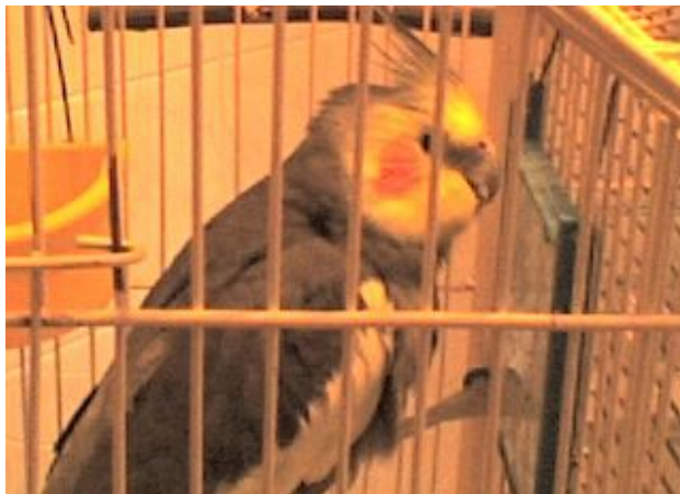
Phot. 2. The cockatiel in individual cages