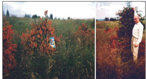
Photographs 2 and 3. Damage to spruce trees after the frost episode of July 20–23, 1996, at mountain dale Hala Izerska in the Izera Mountains, near the estuary of Jagnięcy Potok (photograph by M. Sobik, August 1, 1996).