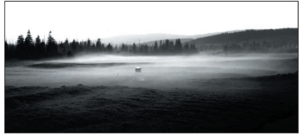
Photograph 1. Radiation fog at mountain dale Hala Izerska, the Jagnięcy Potok measurement station (825 m), view towards direction North-North-West (photograph by G. Urban; June 4, 1999).

Intense minimum air temperature drops below 0°C in the middle of summer are very disruptive to the vital functions of forest ecosystems. Damaged and weakened tree stands are more susceptible to the effects of biotic factors, which in turn can lead to complete die-off.