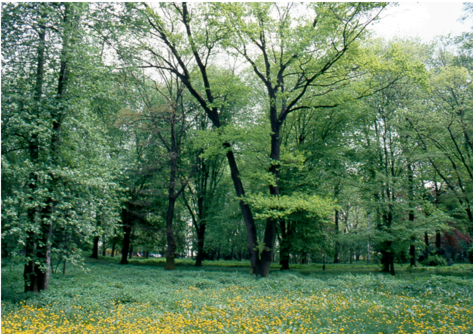
Fig. 3. The largest glade, formed after the removal of dying trees in the Dendrological Park, and its surrounding area. Phot. A. Szczepkowski.