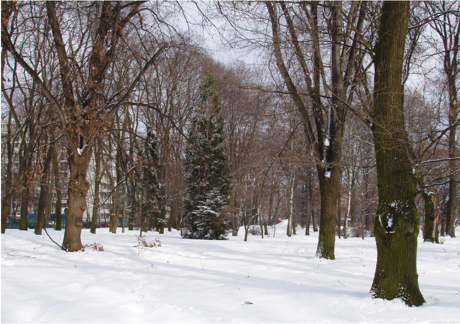
Fig. 2. Snow-covered Dendrological Park. Phot. A. Szczepkowski.