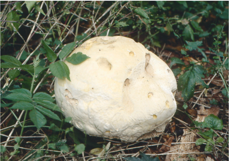
Fig. 5. Langermannia gigantea .