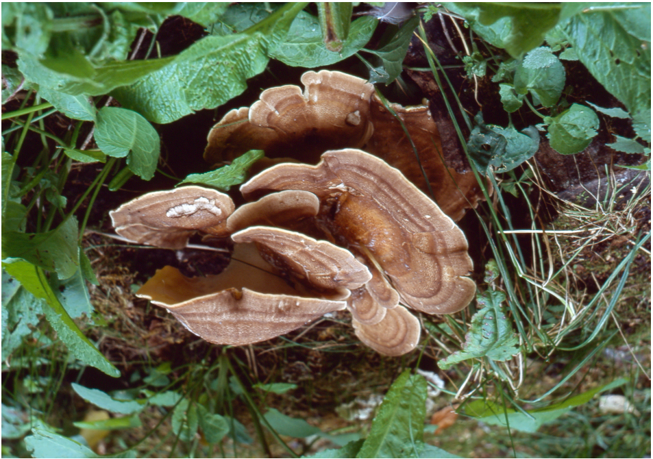
Fig. 6. Meripilus giganteus . Phot. A. Szczepkowski.