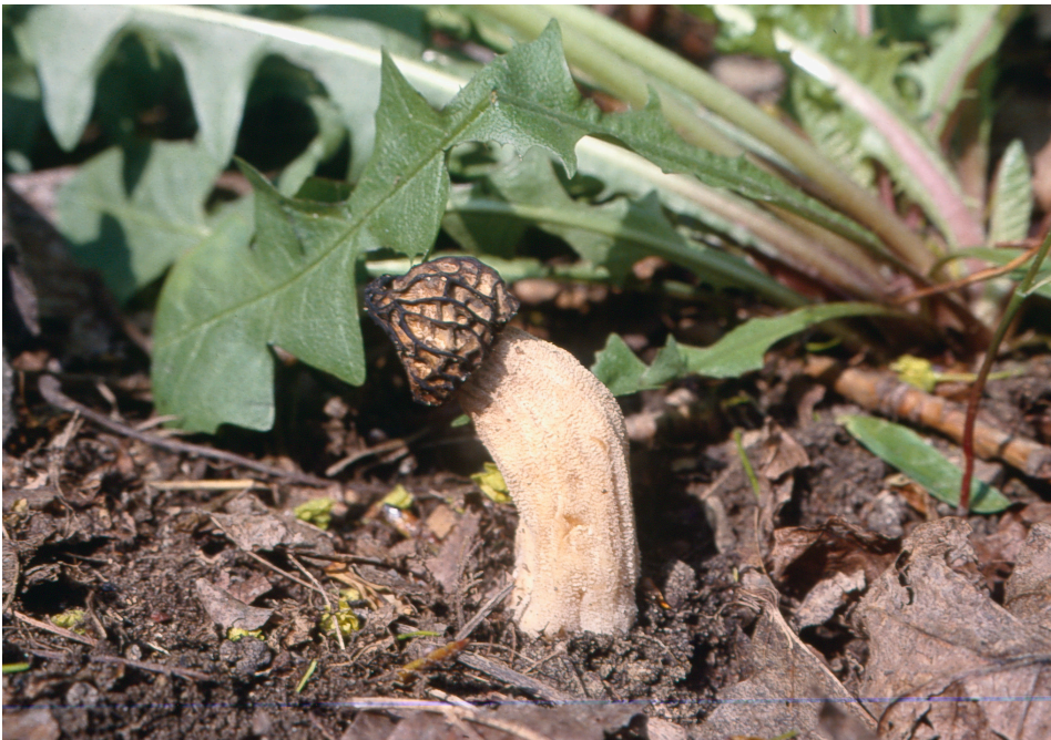
Fig. 7. Morchella semilibera .