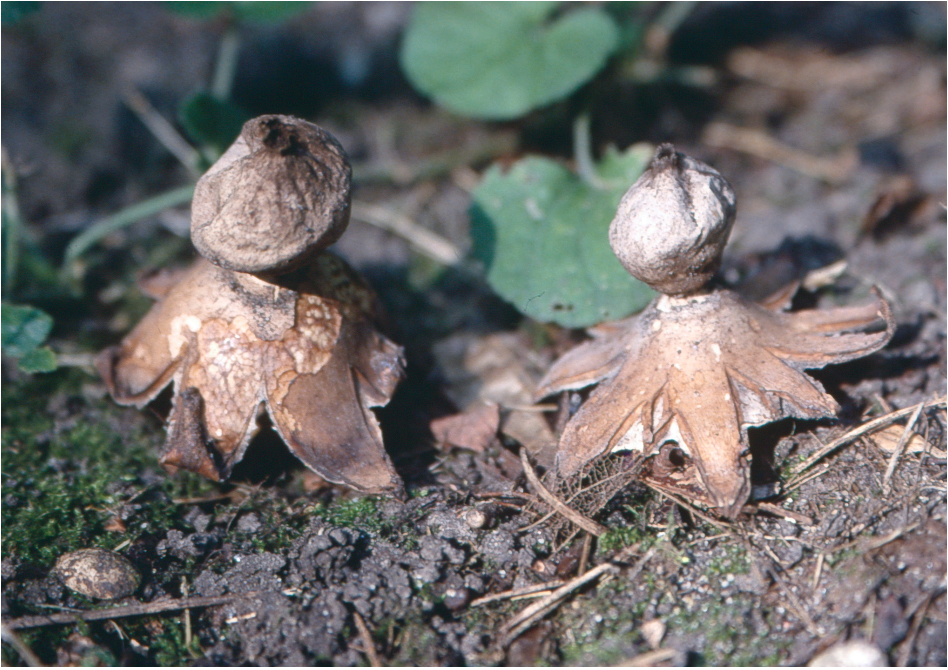
Fig. 4. Gastrum coronatum .