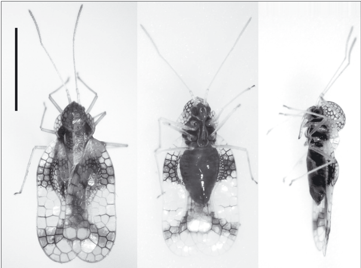
Fig. 1. Adult of Stephanitis takeyai (bar = 2 mm)