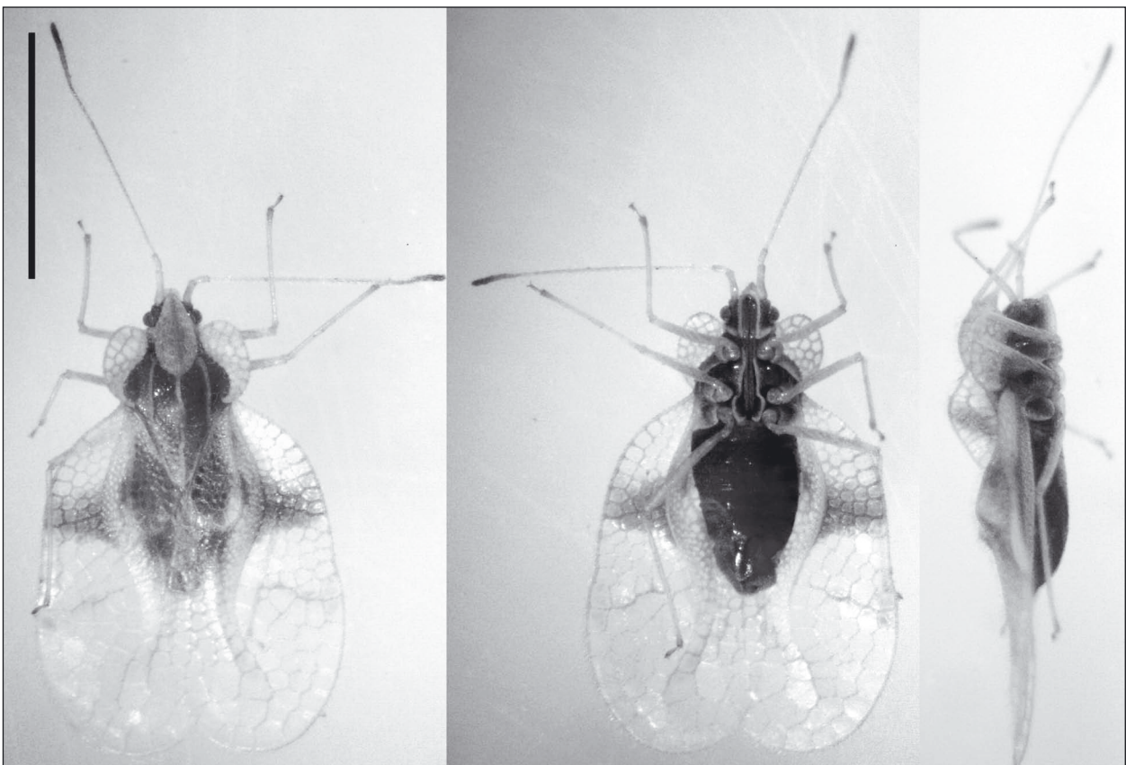
Fig. 2. Adult of Stephanitis rhododendri (bar = 2 mm)