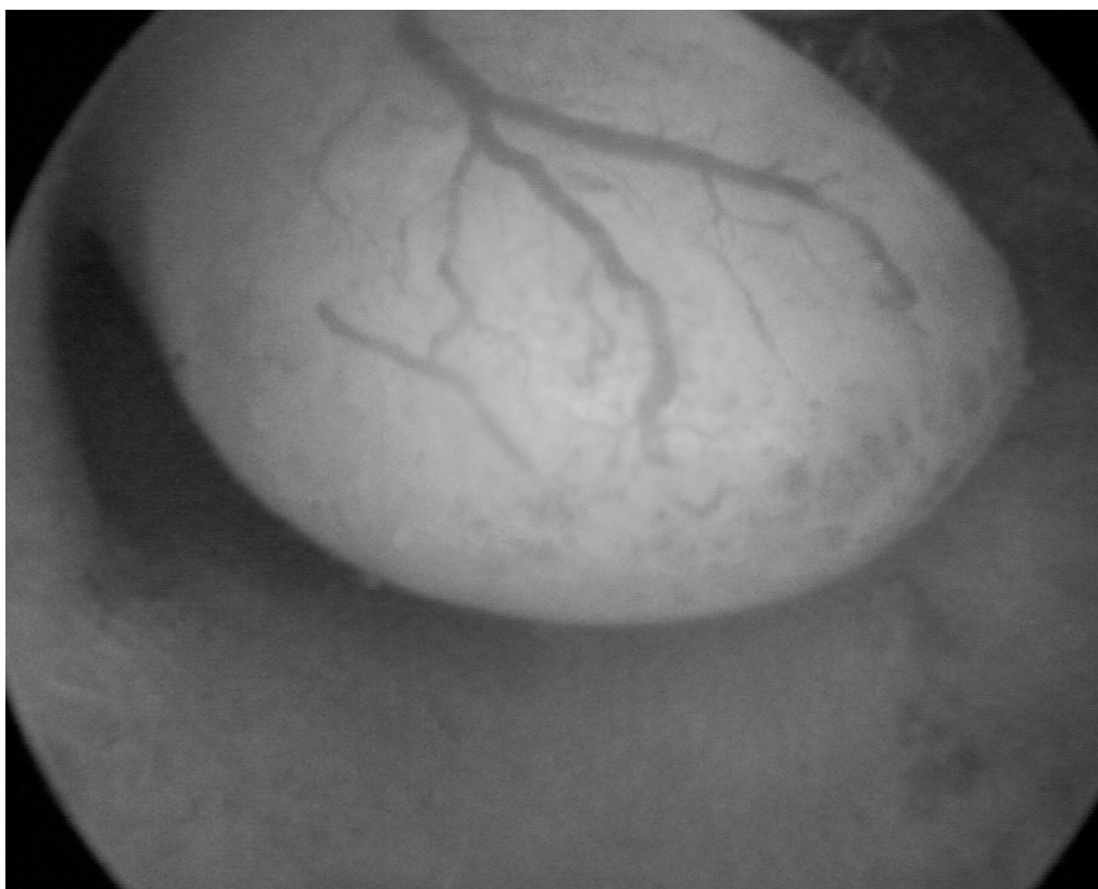
Figure 1. Image of an endometrial polyp during hysteroscopy procedure

Endometrial polyps are the most common pathology of the uterine mucosa. It is a local hyperplasia of the basal layer of the mucosa of the uterine cavity. Endometrial polyps are a mild change, with a diameter not exceeding 3 cm, most likely caused by unbalanced estrogen stimulation. Most often they grow towards the uterine cavity and are pedunculated. They can be found as single and multiple changes in the uterine cavity. Polyps of the body of the uterus can be found in any period of a woman's life. The frequency of their occurrence is about 10% in women of reproductive age and up to 15% in women in the perimenopausal age. In the vast majority of cases, endometrial polyps do not cause clinical signs and are found during routine gynecological examination and ultrasound imaging. If symptoms manifest themselves, women most often complain of heavy menstrual bleeding, breakthrough bleeding/spotting. These changes in women trying to get pregnant may be the cause of infertility acting in a similar way to an intrauterine device. In ultrasound examination endometrial polyps are shown as limited, hyperechoic (significantly higher echogenicity than the uterus muscle) areas of thickening of the uterine mucosa. The image of an endometrial polyp during hysteroscopy procedure is shown in Figure 1 and Figure 2 [1, 2, 3, 4, 5, 6, 7, 8, 9, 10].